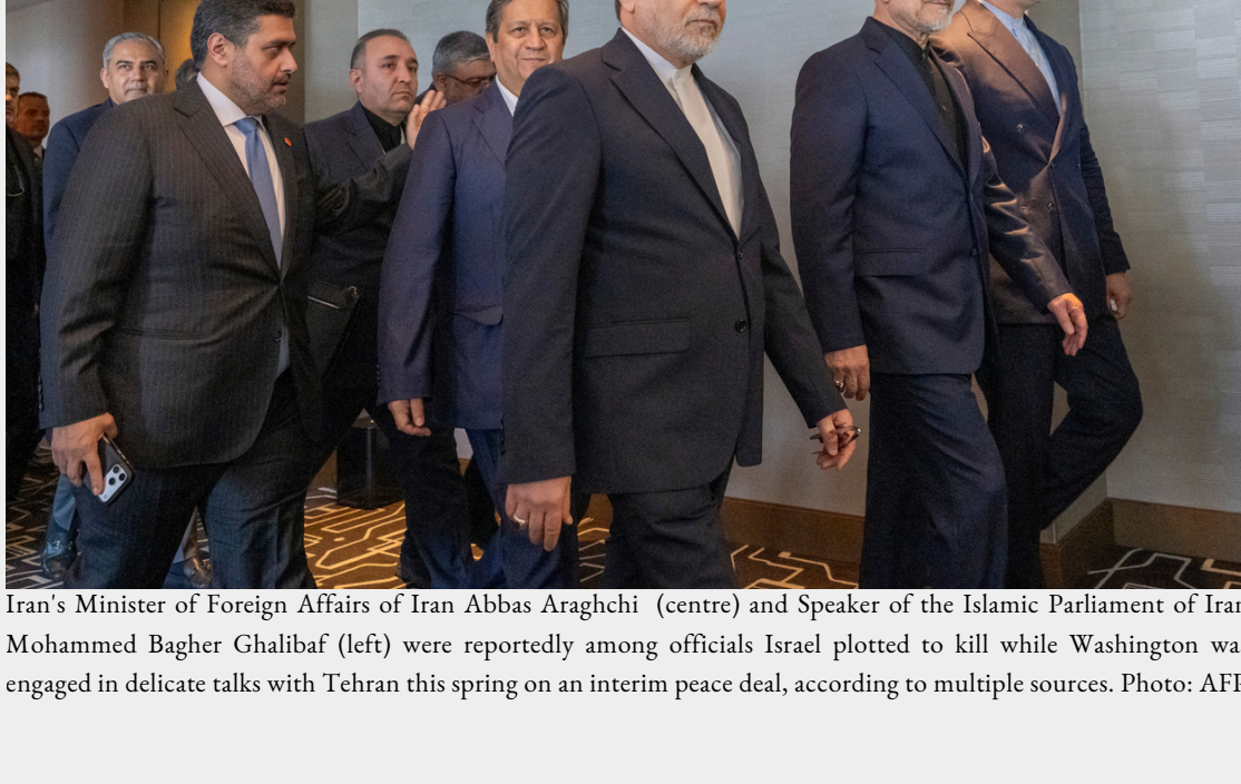
Iran's Minister of Foreign Affairs of Iran Abbas Araghchi (centre) and Speaker of the Islamic Parliament of Iran Mohammed Bagher Ghalibaf (left) were reportedly among officials Israel plotted to kill while Washington was engaged in delicate talks with Tehran this spring on an interim peace deal, according to multiple sources.