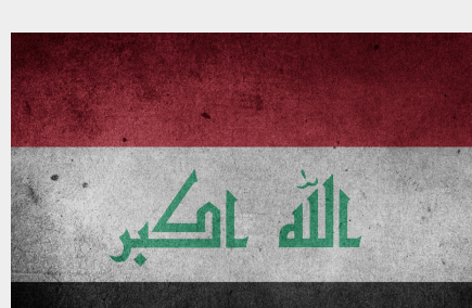
Several powerful Iran-backed armed factions have seen their political and financial clout increase in Iraq over the years.

The government in Baghdad has given pro-Iran armed groups until 30 September to disarm, coinciding with the end of the US-led anti-jihadist coalition's mission, Iraqi Spokesman Haidar al-Aboudi said on Monday. The announcement comes ahead of a visit to the US by new Iraqi Prime Minister Ali al-Zaidi as Washington presses Baghdad to ensure the factions surrender their weapons. "After this date, all weapons outside the state framework will be subject to legal redress", Mr Haidar added.