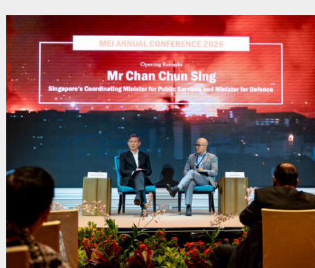
Singapore's Minister for Defence Chan Chun Sing opened the conference in conversation with MEI Chairman Joseph Liow.

At MEI's Annual Conference, three expert panels examined the war's immediate consequences and how its aftermath could reshape Singapore, Asia, and the rest of the world. The discussions also explored broader geopolitical shifts, including how US–China rivalry could play out, the Gulf states' realignment, and the long-term implications for the global economy after the war. Alongside these themes, the panels assessed impacts on maritime security, energy markets, and overall regional stability in an increasingly uncertain international environment. To watch the full event or to get a recap of discussions you missed, click here .