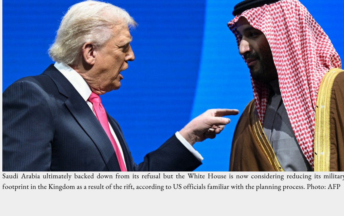
Saudi Arabia ultimately backed down from its refusal but the White House is now considering reducing its military footprint in the Kingdom as a result of the rift, according to US officials familiar with the planning process.

Riyadh, whose bases and airspace were key to a mission to open the Strait of Hormuz, refused US President Donald Trump's request for access. Washington reportedly had to abort the mission and threatened to delay delivery of interceptors needed by the Gulf nation to counter Iranian attacks.