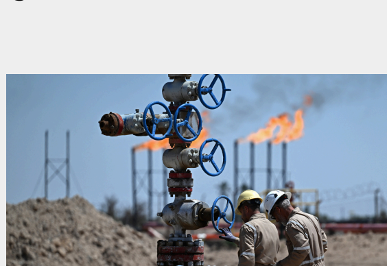
Baghdad is the group's second-largest producer after Saudi Arabia and one of its five founding members.

Baghdad is considering leaving the Organisation of the Petroleum Exporting Countries (Opec) if the producer group does not allow it to significantly increase output, sources with knowledge of the matter told Reuters. The prospect of Iraq leaving would deal a serious blow to the oil cartel, which has already seen the United Arab Emirates walk away less than two months ago. Iraq relies on oil for the bulk of its revenue, which has been slashed since the Iran war effectively blocked exports through the Strait of Hormuz.