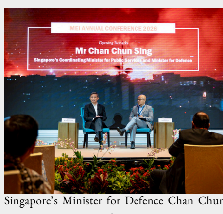
Singapore's Minister for Defence Chan Chun Sing opened the conference, in conversation with MEI Chairman Joseph Liow.

At MEI's Annual Conference, three expert panels examined the war's immediate consequences and how its aftermath could reshape Singapore, Asia, and the wider world. The discussions also explored broader geopolitical shifts, including how US-China rivalry could play out, the Gulf states' realignment, and the long-term implications for the global economy after the war. Alongside these themes, the panels assessed impacts on maritime security, energy markets, and overall regional stability in an increasingly uncertain international environment. To watch the full event or to get a recap of discussions you missed, click here .