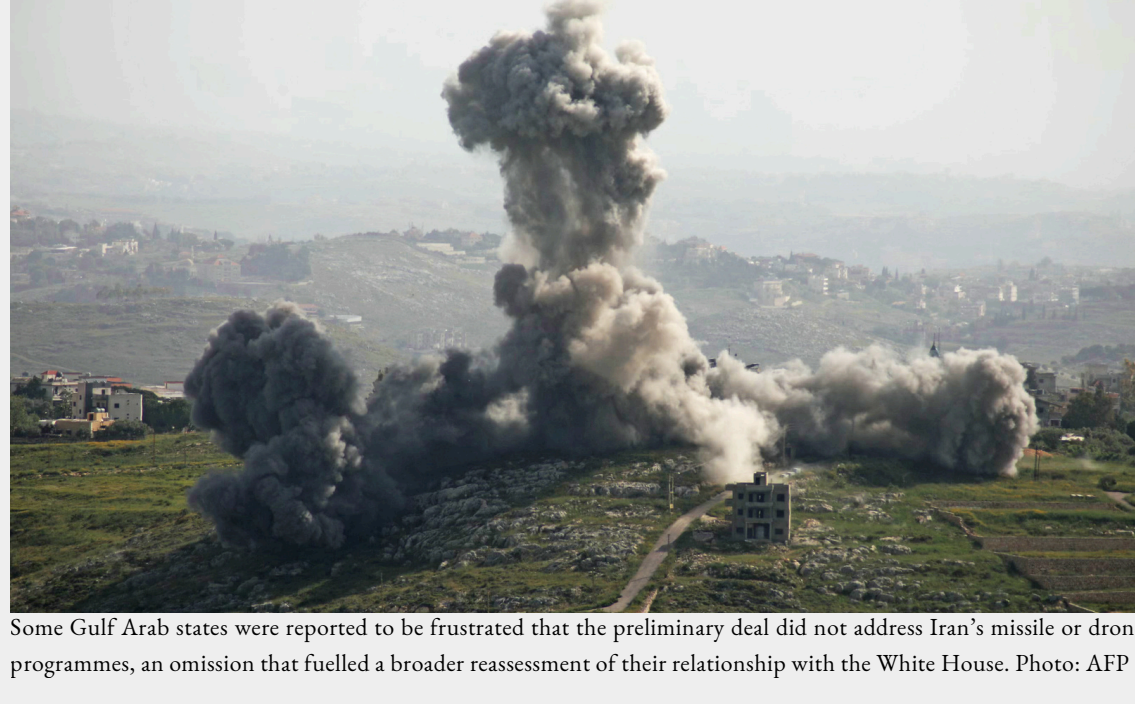
Some Gulf Arab states were reported to be frustrated that the preliminary deal did not address Iran's missile or drone programmes, an omission that fuelled a broader reassessment of their relationship with the White House.

Seeking to ease Gulf Arab leaders' concerns over a preliminary US-Iran deal that left some of their key issues unresolved, Secretary of State Marco Rubio assured them that Washington would protect their interests as it pursues a final settlement with Tehran to end the Middle East war.