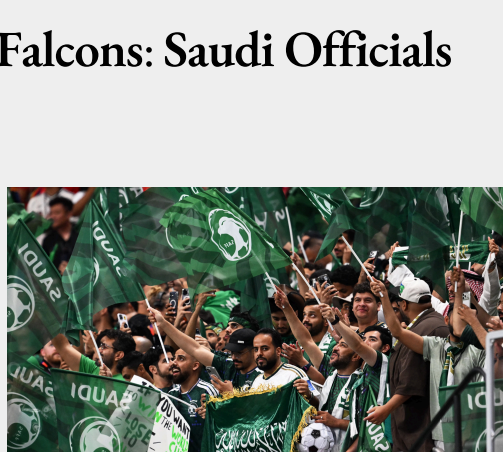
"The players are treating this like a final", reports from the Saudi Arabia team camp said.

Few expected Riyadh to remain in contention for a direct place in the Round of 32 heading into the final matchday of the 2026 Fifa World Cup. Victory is a must for Saudi Arabia if they are to reach the knockout stage for the first time since 1994. Saudi Arabia held Uruguay to a draw, while Cape Verde stunned Spain by earning a point before holding Uruguay again, leaving all four teams with something to play for on the final matchday.