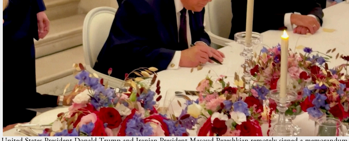
United States President Donald Trump and Iranian President Masoud Pezeshkian remotely signed a memorandum of understanding on Wednesday meant to end the Middle East war, with Tehran agreeing to dilute its uranium in return for economic relief. Mr Trump inked the deal at the Palace of Versailles following a G7 summit.