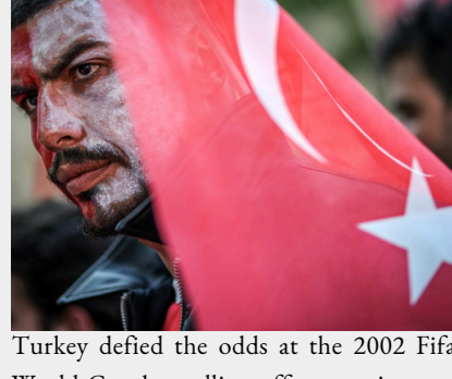
Turkey defied the odds at the 2002 Fifa World Cup by pulling off a stunning run to secure a third place finish.

Turkey heads into tomorrow’s World Cup Group D clash with Paraguay with little margin for error. After an opening defeat against Australia, the team is playing catch-up in the race for the knockout rounds. Another loss would leave the nation facing a daunting final-round scenario, likely relying on other results across the 48-team tournament to stay alive — a disappointing position for a side tipped to be the US’ strongest challenger in the group upon returning to the World Cup for the first time in 24 years.