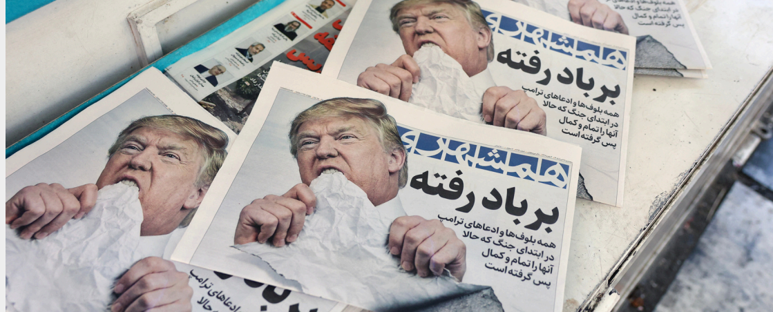
The issue of Iran’s nuclear programme will be negotiated over a extendable 60-day window. President Trump warned that the US would “bomb the hell” out of Iran if it violates the terms or fails to reach a final deal.

US President Donald Trump and Iranian President Masoud Pezeshkian signed a memorandum of understanding to develop a permanent peace deal. This agreement reopens the Strait of Hormuz, establishes a US$300 billion ‘reconstruction’ fund for Iran, and lifts all US sanctions.