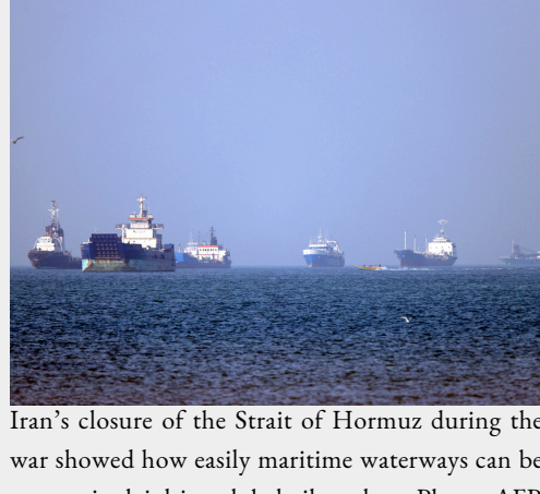
Iran’s closure of the Strait of Hormuz during the war showed how easily maritime waterways can be weaponised, jolting global oil markets.

An initial deal to end the war has been signed, but the global fallout may be far from over. As world leaders have rightly warned, the long-term consequences will run deep — from sky-high inflation to volatile energy markets that test global resilience. Across three expert panels, the MEI Annual Conference deliver a critical, forward-looking look at this new reality, evaluating how the post-war landscape will permanently alter world trade, stability and security in the long run. This flagship event will be held both in person at the Orchard Hotel Ballroom and online via Zoom from 9:00 AM to 4:00 PM (SGT). Last call to sign up here .