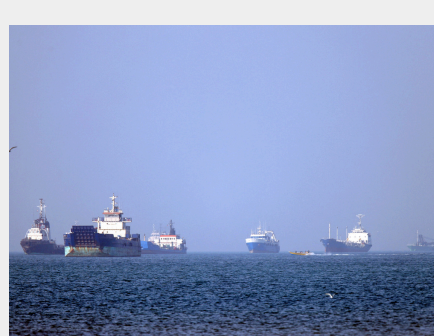
Experts warned that oil prices could surge if the strait stays closed, as US petroleum supplies near two-decade lows.

Mr Trump sought to project optimism about reaching a deal to end the war he started against Iran even as he acknowledged the crisis could drag on for several more months. When asked whether the blockade of Tehran would last until Labour Day on 7 September, he said, "I don't know. I mean, it could be, but I think it's unlikely".