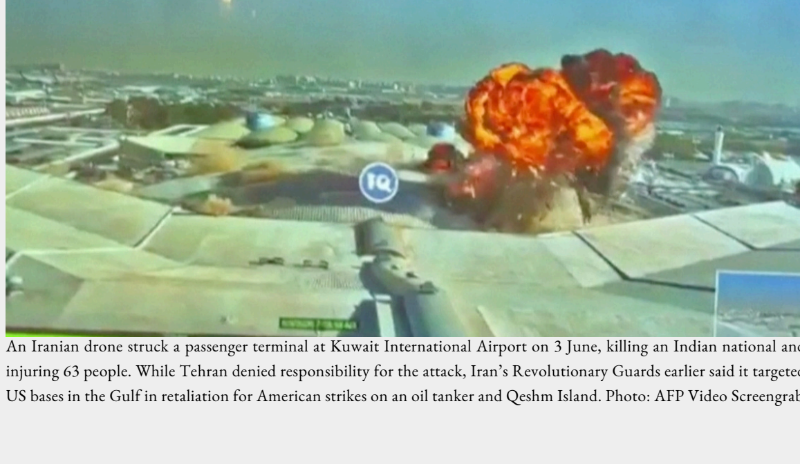
An Iranian drone struck a passenger terminal at Kuwait International Airport on 3 June, killing an Indian national and injuring 63 people. While Tehran denied responsibility for the attack, Iran's Revolutionary Guards earlier said it targeted US bases in the Gulf in retaliation for American strikes on an oil tanker and Qeshm Island.