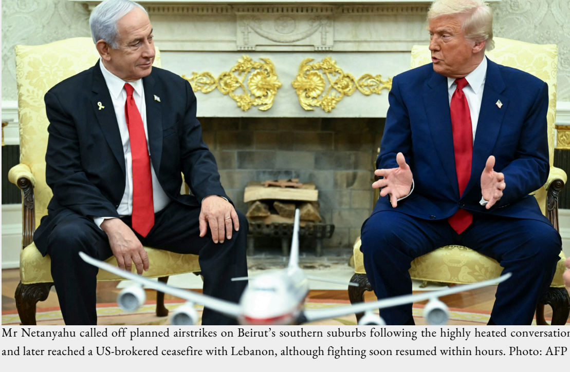
Mr Netanyahu called off planned airstrikes on Beirut's southern suburbs following the highly heated conversation and later reached a US-brokered ceasefire with Lebanon, although fighting soon resumed within hours.

US President Donald Trump lashed out at Israeli Prime Minister Benjamin Netanyahu over Tel Aviv's escalation in Lebanon in an expletive-laden call. Mr Trump called the Israeli premier "crazy" and accused him of ingratitude, even saying, "you'd be in prison if it weren't for me".