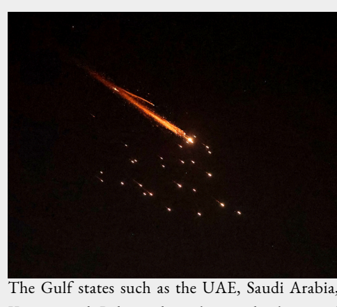
The Gulf states such as the UAE, Saudi Arabia, Kuwait and Bahrain have borne the brunt of Iranian retaliatory attacks in the war.

This year's conference, which will be opened by Singapore's Coordinating Minister for Public Services and Minister for Defence Chan Chun Sing, will focus on the war in Iran and its far-reaching global implications, unpacking how the crisis is reshaping regional dynamics and international responses. It will also examine what a post-war scenario could mean for Singapore, South-east Asia, and the rest of the world. This flagship event will be held both in-person and online at the Orchard Hotel Ballroom and Zoom from 9:00 AM to 4:00 PM (SGT). Seats are limited so sign up now by clicking here .