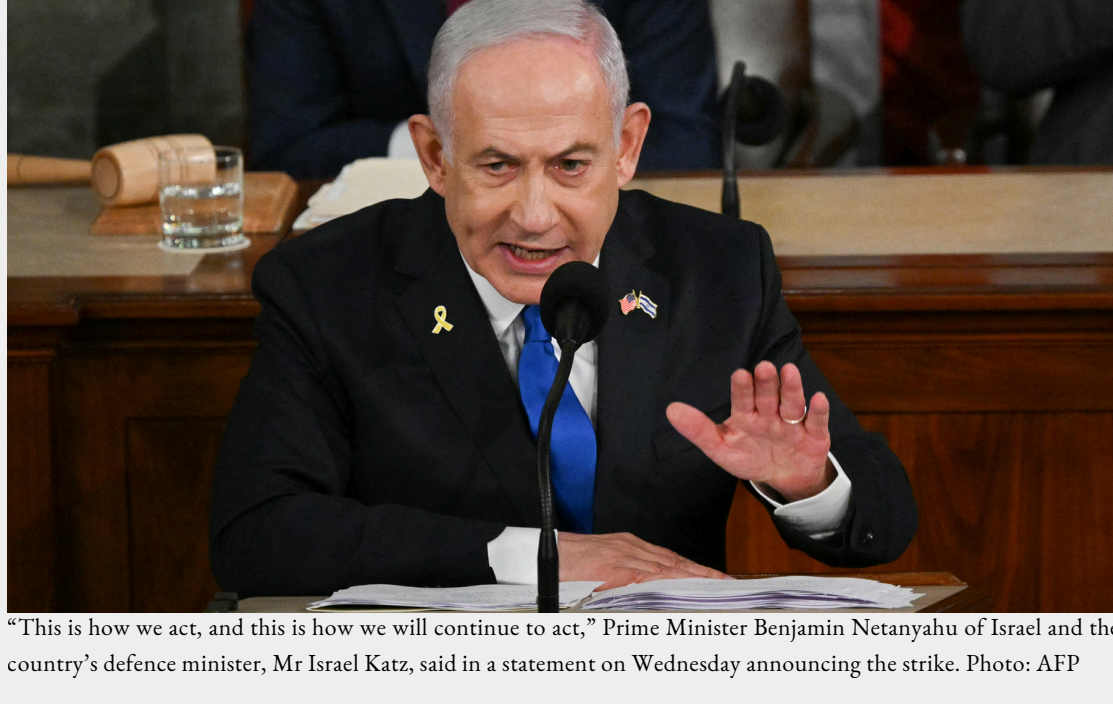
“This is how we act, and this is how we will continue to act,” Prime Minister Benjamin Netanyahu of Israel and the country’s defence minister, Mr Israel Katz, said in a statement on Wednesday announcing the strike.

In the first attack near the Lebanese capital since a US-mediated ceasefire took effect last month, the Israeli military said it killed the commander of Hezbollah’s Radwan force. This threatened an already tenuous truce, with both sides continuing to exchange daily attacks.