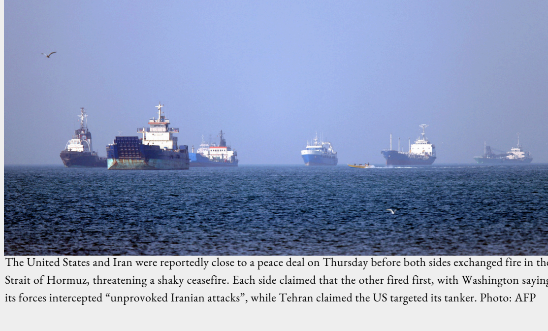
The United States and Iran were reportedly close to a peace deal on Thursday before both sides exchanged fire in the Strait of Hormuz, threatening a shaky ceasefire. Each side claimed that the other fired first, with Washington saying its forces intercepted “unprovoked Iranian attacks”, while Tehran claimed the US targeted its tanker.