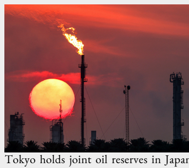
Tokyo holds joint oil reserves in Japan with producing countries, including the UAE and Saudi Arabia.