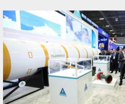
The Yildirimhan has a range of 6,000km, with a maximum speed of Mach 25 and a payload capacity of 3,000kg.

The intercontinental ballistic missile, named Yildirimhan — meaning “lightning” in Turkish — was unveiled on Tuesday at the Saha 2026 Defence and Aerospace Exhibition at the Istanbul Expo Centre. Developed by the Defence Ministry’s research and development centre, it reflected Turkey’s push for greater self-reliance and its ambition to position itself as a key defence player among its Nato allies and in the Middle East.