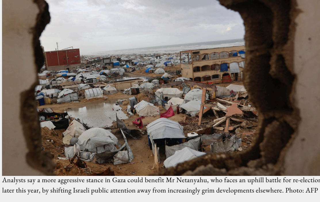
Analysts say a more aggressive stance in Gaza could benefit Mr Netanyahu, who faces an uphill battle for re-election later this year, by shifting Israeli public attention away from increasingly grim developments elsewhere.

Prime Minister Benjamin Netanyahu directed Israeli forces to expand their control of the Gaza Strip, ramping up the pressure on Hamas. His announcement came as negotiations on Gaza's future stalled over the militant group's refusal to disarm and Israel's nearly daily strikes there.