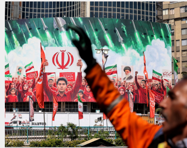
"We don't know whether or not they're going to give the players their visas", the ambassador added.

Iran's national football team still lack US visas and are not competing in the tournament on "equal terms" because of their difficulty in training ahead of the competition, the country's ambassador to Mexico said. The ambassador told a news conference that "the country to the north" – referring to the US – had not followed through on its responsibility of hosting the Iranian team.