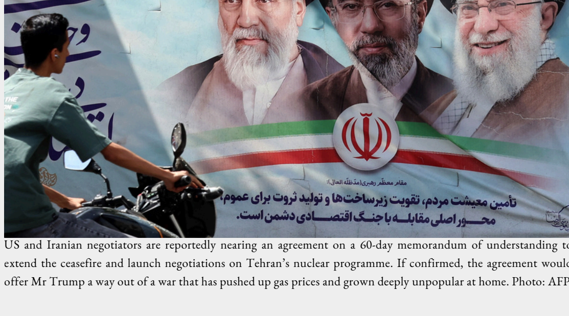
US and Iranian negotiators are reportedly nearing an agreement on a 60-day memorandum of understanding to extend the ceasefire and launch negotiations on Tehran's nuclear programme. If confirmed, the agreement would offer Mr Trump a way out of a war that has pushed up gas prices and grown deeply unpopular at home.