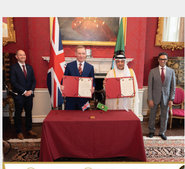
It is also the first deal between a G7 country and the GCC bloc.

Britain said on Wednesday it had secured a trade deal with the Gulf Cooperation Council worth US$5 billion a year in the long run, deepening economic ties with allies in a region dealing with the fallout from the Iran war. The government said that cars, aerospace, electronics and food and drink would be among the sectors to benefit, with cereals, cheddar cheese, chocolate and butter all becoming tariff-free.