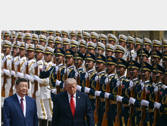
Beijing is positioning President Xi Jinping as the 'adult in the room' against an erratic new America.

Amid ongoing instability in the Middle East, China's evolving role in the region has become a subject of growing analytical interest. MEI, in collaboration with Cambridge MENAF, is bringing you this exclusive webinar to examine how Beijing is navigating challenges brought on by the Iran war, and what they signal for energy security, great power competition, and the emerging multipolar order. This event will be held via Zoom on Thursday, 11 June 2026, from 5:00 PM to 6:00 PM (SGT). To sign up, click here .