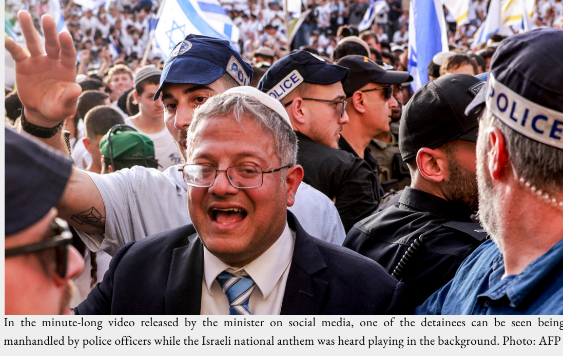
In the minute-long video released by the minister on social media, one of the detainees can be seen being manhandled by police officers while the Israeli national anthem was heard playing in the background.

National Security Minister Itamar Ben-Gvir posted a video of himself taunting detained pro-Palestinian activists while they were handcuffed and forced to kneel down, drawing outrage both abroad and at home — including from his own ally Prime Minister Benjamin Netanyahu.