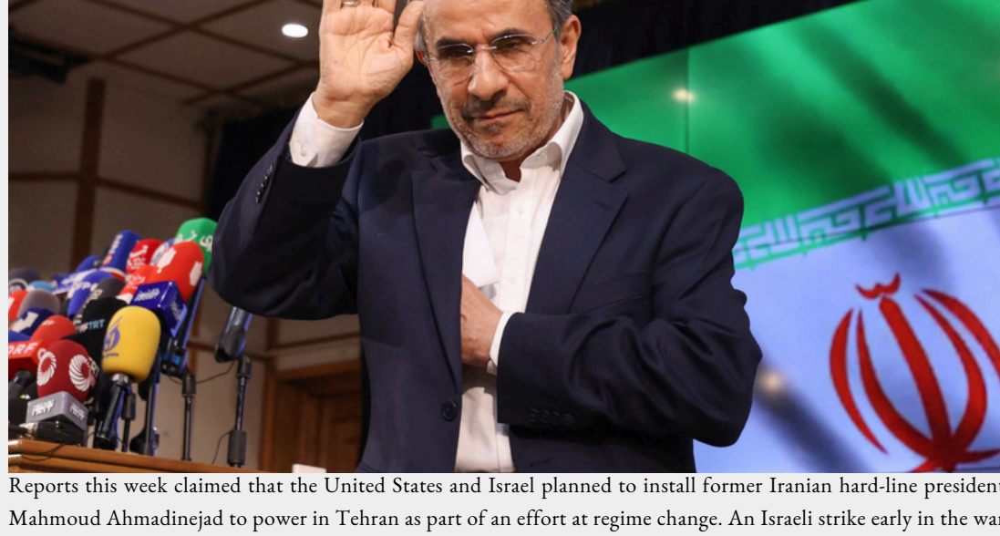
Reports this week claimed that the United States and Israel planned to install former Iranian hard-line president Mahmoud Ahmadinejad to power in Tehran as part of an effort at regime change. An Israeli strike early in the war was designed to free him from house arrest but the plan quickly went awry, according to US officials.