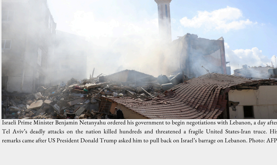
Israeli Prime Minister Benjamin Netanyahu ordered his government to begin negotiations with Lebanon, a day after Tel Aviv's deadly attacks on the nation killed hundreds and threatened a fragile United States-Iran truce. His remarks came after US President Donald Trump asked him to pull back on Israel's barrage on Lebanon.