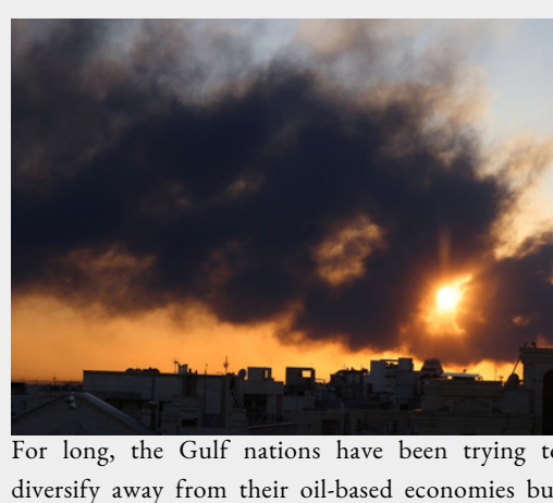
For long, the Gulf nations have been trying to diversify away from their oil-based economies but the Iran war has forced them to reboot.

The guns may have fallen silent — for now. But the Gulf is still grappling with the fallout of missile and drone attacks, which exposed the region’s vulnerabilities. Missed this? Catch the key insights from MEI’s recent webinar, where regional experts unpacked what this means for the Gulf’s trajectory — now available as a recap video and podcast here .