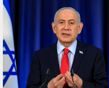
The trial will begin with a hearing, which is set to include testimony from a defence witness.

Israeli Prime Minister Benjamin Netanyahu’s long-running corruption trial will resume on Sunday, the courts’ spokesperson said on Thursday, hours after Tel Aviv lifted a state of emergency imposed over its war with Iran. He is facing charges in two cases in which he allegedly negotiated favourable media coverage from Israeli news outlets, and a third involving accusations that he accepted more than US$260,000 in luxury gifts from billionaires in exchange for political favours.