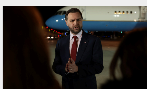
Iranian officials are seeking a guarantee from the US of a more permanent end to hostilities.

US Vice President JD Vance (pictured) will lead an American delegation — including special envoy Steve Witkoff and Jared Kushner — for talks with Iranian officials in Pakistan tomorrow, as Israeli strikes in Lebanon test a fragile ceasefire. The discussions are expected to focus on Iran’s nuclear enrichment and ballistic missile programmes, as well as tensions surrounding the Strait of Hormuz.