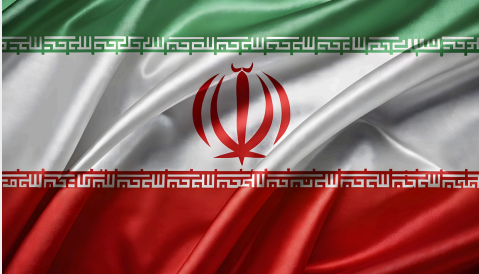
Iran will play its fourth straight World Cup finals when the tournament takes place.