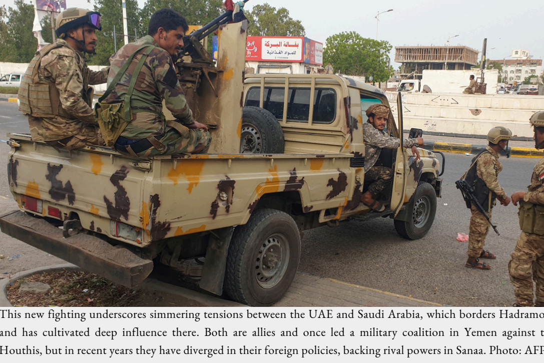
This new fighting underscores simmering tensions between the UAE and Saudi Arabia, which borders Hadramout and has cultivated deep influence there. Both are allies and once led a military coalition in Yemen against the Houthis, but in recent years they have diverged in their foreign policies, backing rival powers in Sanaa.

The separatist group seized control of much of Hadramout and were battling to secure the region's oil fields, local residents and the group's officials said. This rapid offensive marked a potential turning point, which could eventually lead to the country's division into two states.