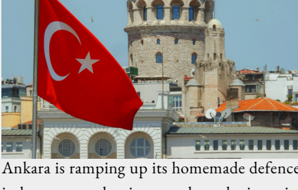
Ankara is ramping up its homemade defence industry production and reducing its reliance on foreign suppliers.

Turkey's defence ministry said on Thursday that construction had begun on its first indigenous submarine (Milden), and announced that Ankara had also completed its first sale of a corvette warship to a North Atlantic Treaty Organisation (Nato) ally after signing an agreement with Romania. The country said last week that contractors had started work on its indigenous TF-2000 naval air-defence destroyer. The vessel will form part of the planned "Steel Dome" multi-layered air-defence system.