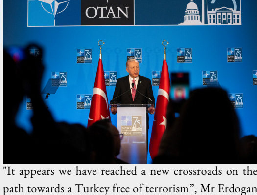
“It appears we have reached a new crossroads on the path towards a Turkey free of terrorism”, Mr Erdogan told his ruling Party lawmakers”.

President Recep Tayyip Erdogan said on Wednesday that Turkey had entered a “new phase” in efforts to end Kurdish militant violence and signalled he was open to the idea of jailed Kurdistan Workers Party (PKK) leader Abdullah Ocalan addressing lawmakers. Mr Erdogan said he held “very constructive” talks last week with senior pro-Kurdish Peoples’ Equality and Democracy Party (DEM) leaders - who urged the idea of Ocalan addressing a Parliamentary commission on PKK disarmament - and he urged all actors to contribute.