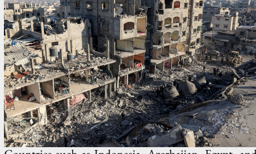
Countries such as Indonesia, Azerbaijan, Egypt, and Turkey have expressed their willingness to contribute troops to the coalition, which will be named as the International Security Force (ISF).

According to sources, the White House sent several United Nations (UN) Security Council members a draft resolution on Monday for the establishment of an international force in Gaza for a duration of at least two years. The draft resolution “would give the US and other participating countries a broad mandate to govern Gaza and provide security through the end of 2027, with the possibility of extensions after that”.