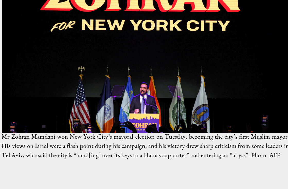
Mr Zohran Mamdani won New York City’s mayoral election on Tuesday, becoming the city’s first Muslim mayor. His views on Israel were a flash point during his campaign, and his victory drew sharp criticism from some leaders in Tel Aviv, who said the city is “hand[ing] over its keys to a Hamas supporter” and entering an “abyss”.