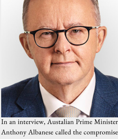
In an interview, Australian Prime Minister Anthony Albanese called the compromise with Turkey an "outstanding result".

The 31st edition of the Conference of the Parties (COP31) climate meeting is now expected to be held in Turkey after Australia dropped its bid to host the event. Neither country had initially been willing to concede, but Australia later agreed to back Ankara's bid in exchange for its minister chairing the talks, following negotiations at COP30 in Brazil.