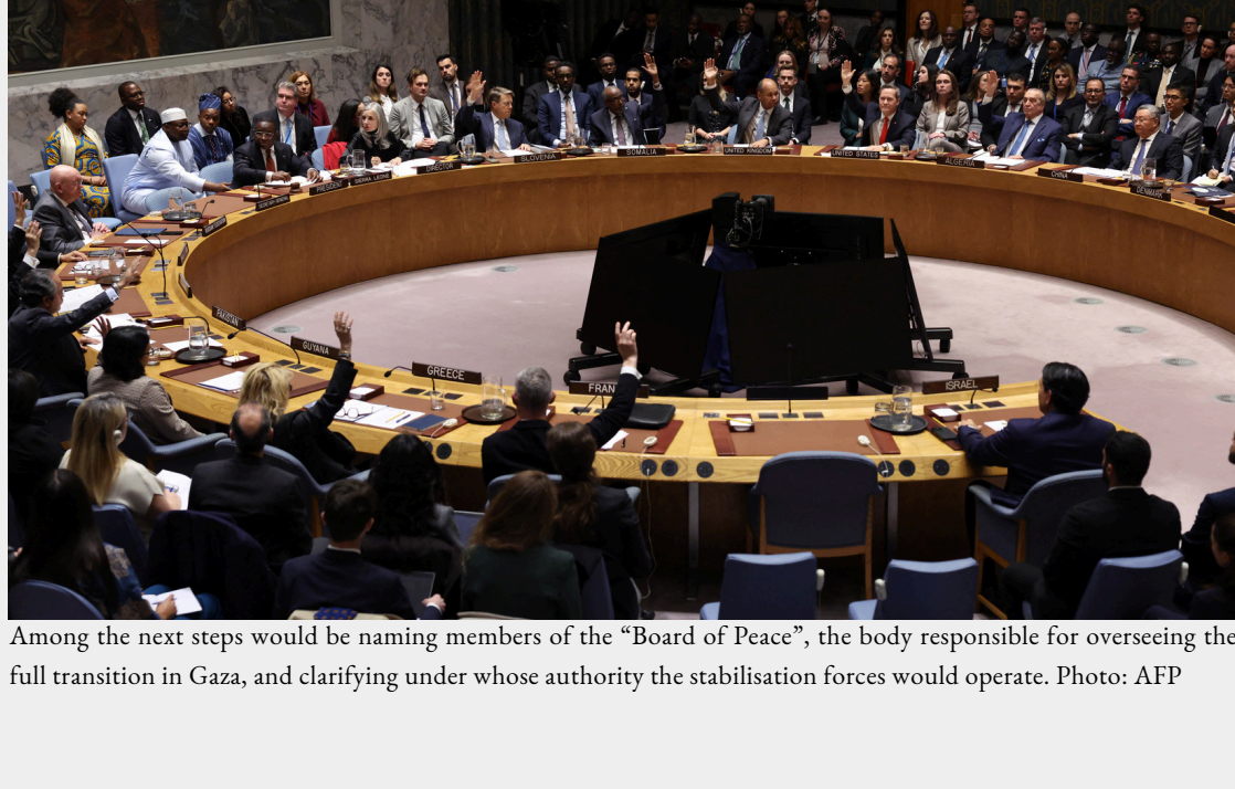
Among the next steps would be naming members of the "Board of Peace", the body responsible for overseeing the full transition in Gaza, and clarifying under whose authority the stabilisation forces would operate.

The United Nations (UN) Security Council's vote marked a diplomatic victory for the Trump administration, whose resolution called for an International Stabilisation Force to enter, demilitarise, and govern Gaza. Russia and China — both able to veto — chose to abstain.