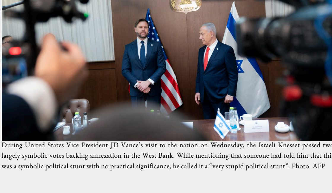
During United States Vice President JD Vance’s visit to the nation on Wednesday, the Israeli Knesset passed two largely symbolic votes backing annexation in the West Bank. While mentioning that someone had told him that this was a symbolic political stunt with no practical significance, he called it a “very stupid political stunt”.