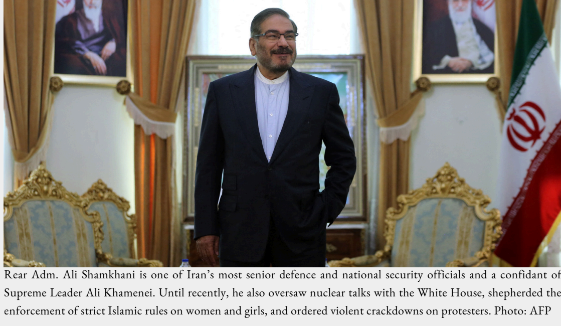
Rear Adm. Ali Shamkhani is one of Iran’s most senior defence and national security officials and a confidant of Supreme Leader Ali Khamenei. Until recently, he also oversaw nuclear talks with the White House, shepherded the enforcement of strict Islamic rules on women and girls, and ordered violent crackdowns on protesters.

Rear Adm. Ali Shamkhani was accused of leading a double life after walking his daughter — who wore a low-cut, strapless dress — down the aisle at her wedding. The video, which went viral, showed that other women in attendance, including his wife, were also without hijabs.