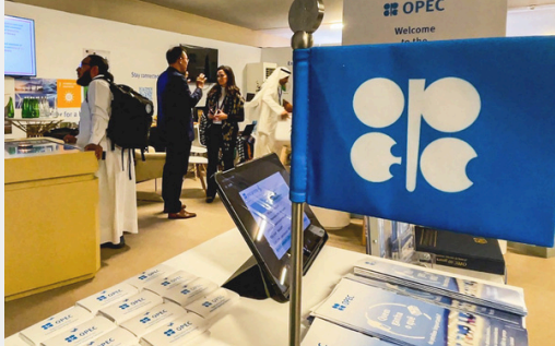
Global oil prices rose by 5% on Thursday following the news of sanctions, which also prompted India to consider cutting Russian imports.

Kuwait’s Oil Minister Tariq Al-Roumi said on Thursday that the organisation is ready to increase production by rolling back its output cuts if needed to address market shortfalls following new US sanctions on Russian oil majors. He added that he expects demand to shift toward the Gulf and the Middle East as a result of the sanctions.