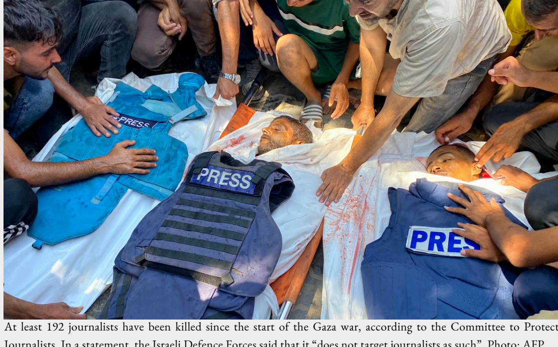
At least 192 journalists have been killed since the start of the Gaza war, according to the Committee to Protect Journalists. In a statement, the Israeli Defence Forces said that it "does not target journalists as such".

After a pair of strikes on a Gaza hospital that killed 22 people, including five journalists, Israel faced fierce global condemnation. Israeli Prime Minister Benjamin Netanyahu called the incident a "tragic mishap" and said that Tel Aviv was "conducting a thorough investigation".