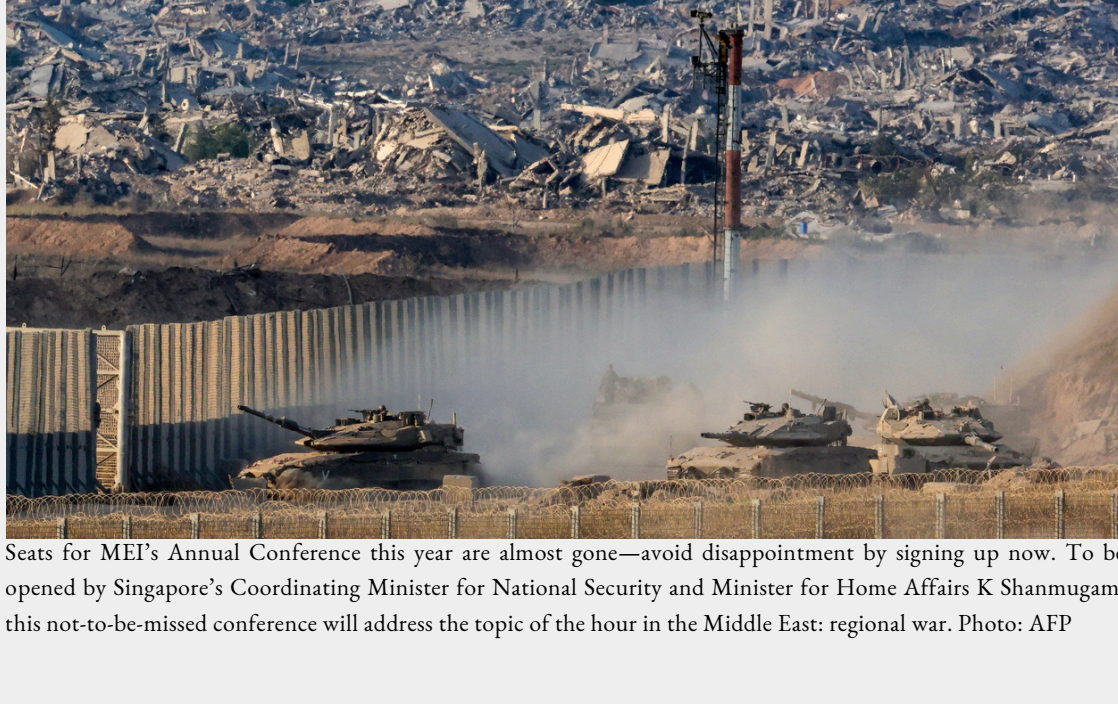
Seats for MEI's Annual Conference this year are almost gone—avoid disappointment by signing up now. To be opened by Singapore's Coordinating Minister for National Security and Minister for Home Affairs K Shanmugam, this not-to-be-missed conference will address the topic of the hour in the Middle East: regional war.