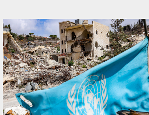
The goal, the UN said, is to leave "Lebanon fully in charge of southern security".

The United Nations Security Council voted unanimously on Thursday to end its peacekeeping mission in southern Lebanon over the next two years, marking the conclusion of an effort launched nearly half a century ago to stabilise the volatile border between Beirut and Tel Aviv.