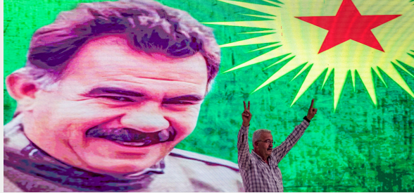
The PKK, which has been locked in a bloody conflict with the Turkish state for more than four decades, decided in May to disband and end its armed struggle.

The handover of weapons by the outlawed Kurdistan Workers Party (PKK) in Iraq, following its decision to disband, should be completed within a few months, Turkey’s ruling AK Party’s spokesperson, Mr Omer Celik, said late on Wednesday. Speaking to broadcaster NTV, Mr Celik said a confirmation mechanism, including officials from Turkish intelligence and the armed forces, will oversee the handover process.