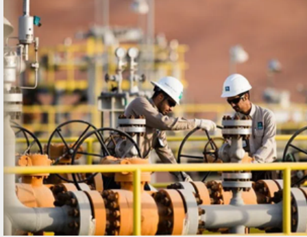
The 12-day conflict sent oil prices surging to a five-month high and then retreated to pre-crisis levels after a ceasefire.

Saudi Arabia, the world’s biggest oil exporter, may raise its August crude oil prices for buyers in Asia to the highest in four months, after spot prices surged during the Iran-Israel conflict and on robust summer fuel demand, trade sources said. Additionally, the Organisation of the Petroleum Exporting Countries (Opec) and their allies are set to announce another big production increase of 411,000 barrels per day for August as it looks to regain market share, four delegates from the group told Reuters.