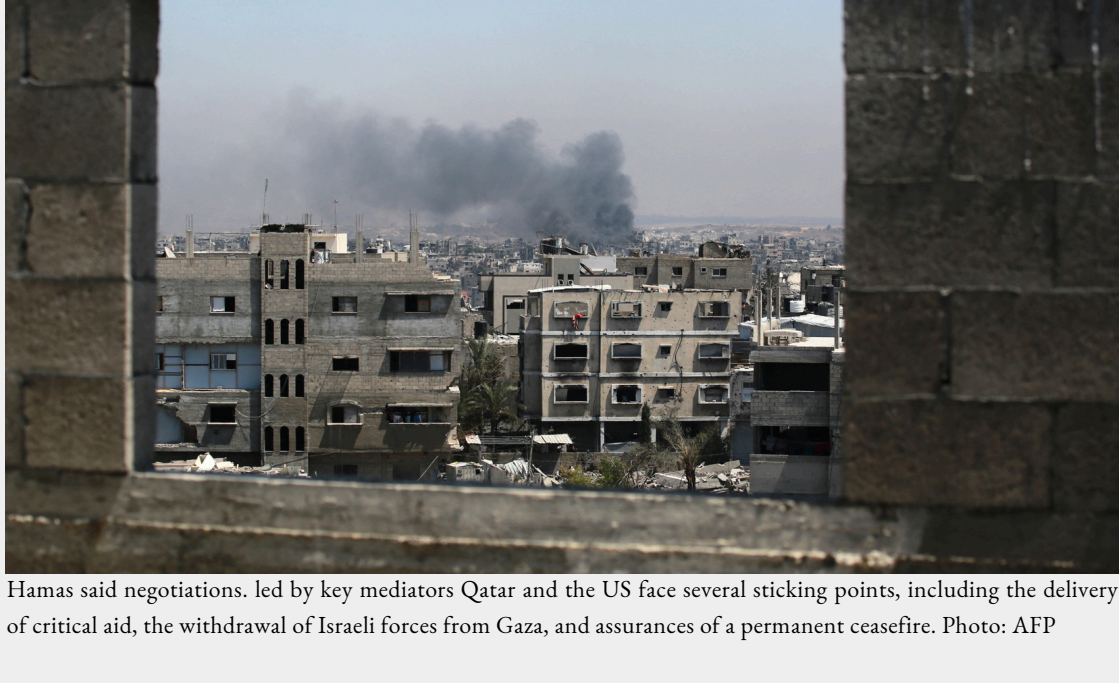
Hamas said negotiations, led by key mediators Qatar and the US face several sticking points, including the delivery of critical aid, the withdrawal of Israeli forces from Gaza, and assurances of a permanent ceasefire.

As Israeli Prime Minister Benjamin Netanyahu conducted high-level talks in Washington, Hamas said it would release 10 hostages held in Gaza in a bid to reach a ceasefire deal. The militant group framed the move as part of its “commitment to the success” of peace talks.