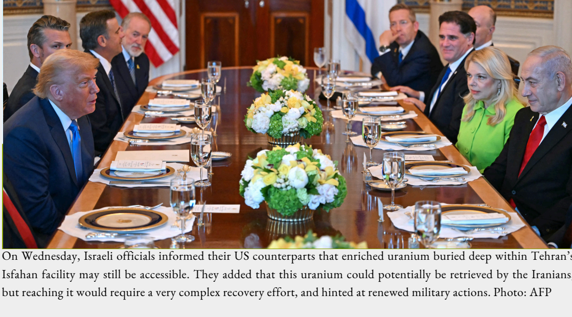
On Wednesday, Israeli officials informed their US counterparts that enriched uranium buried deep within Tehran’s Isfahan facility may still be accessible. They added that this uranium could potentially be retrieved by the Iranians, but reaching it would require a very complex recovery effort, and hinted at renewed military actions.