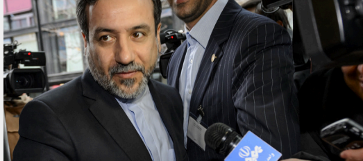
Iran’s Foreign Minister Abbas Araghchi arrived in Oman on 11 May for talks with the US, which may have covered the idea of the proposal.

Tehran floated the idea of a consortium of Middle Eastern countries – including Iran, Saudi Arabia and the UAE – to enrich uranium, in a effort to overcome US objections to its continued nuclear programme. The proposal is seen as a way of locking the Gulf states into supporting the Islamic Republic’s position that it should be allowed to retain enrichment capabilities.