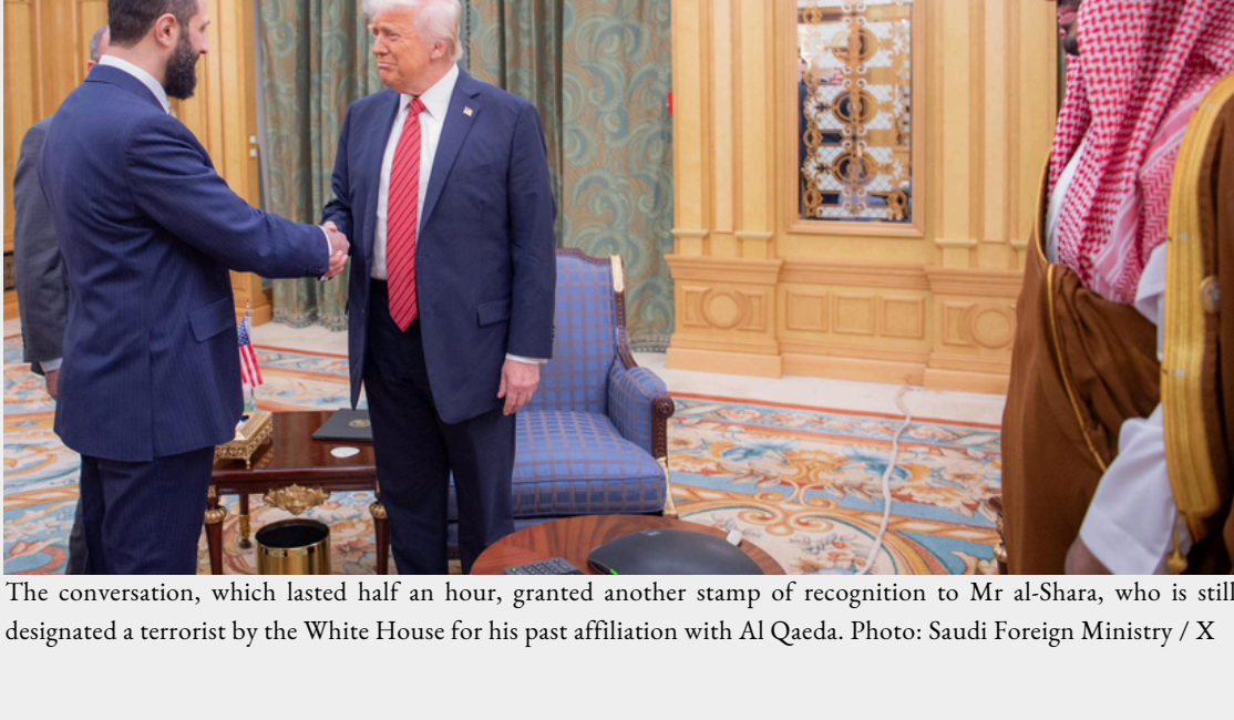
The conversation, which lasted half an hour, granted another stamp of recognition to Mr al-Shara, who is still designated a terrorist by the White House for his past affiliation with Al Qaeda.

After a historic meeting with Syrian President Ahmed al-Shara at the request of Saudi Arabia’s Crown Prince, Mr Trump announced plans to lift US sanctions on Damascus. This decision took many in his administration by surprise and is expected to take effect in the coming weeks.