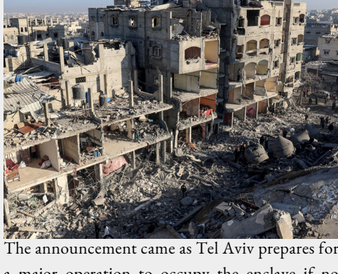
The announcement came as Tel Aviv prepares for a major operation to occupy the enclave if no ceasefire is reached this week.

The Israeli government agreed to resume humanitarian aid delivery to Palestinians in Gaza, the new Gaza Humanitarian Foundation (GHF) said in a statement on Wednesday. This effort would bypass the decades-old infrastructure put in place by the UN and its agencies, despite protests by the international body and several world leaders.