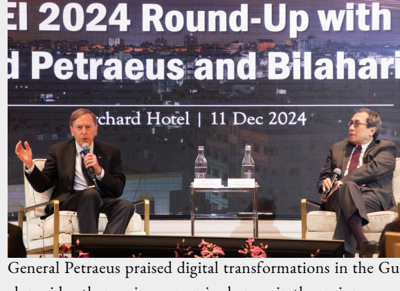
General Petraeus praised digital transformations in the Gulf alongside other socio-economic changes in the region.

MEI organised a year-end Middle East round-up event, featuring General David Petraeus, former US Army commander in Iraq and former CIA director. He discussed the latest developments in Syria, offered insights on the Gaza war, and explored other key topics. Revisit the event or catch up on what you missed by watching the video here .