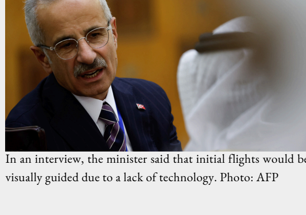
In an interview, the minister said that initial flights would be visually guided due to a lack of technology.

Ankara is planning to start flights to Syria's Damascus in the coming days, Turkish Transport Minister Abdulkadir Uraloglu (pictured) said on Thursday. "When the connection from Damascus to Istanbul is established, we will have solved a great need. Our efforts continue on this issue", he added.