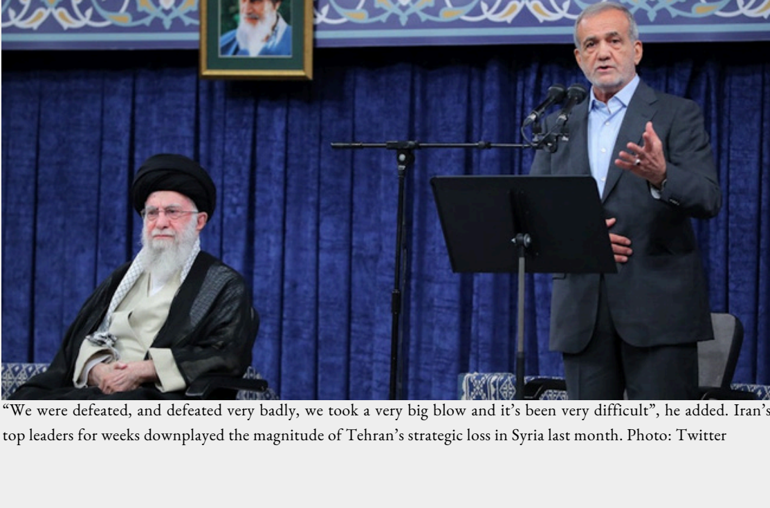
"We were defeated, and defeated very badly, we took a very big blow and it's been very difficult", he added. Iran's top leaders for weeks downplayed the magnitude of Tehran's strategic loss in Syria last month.