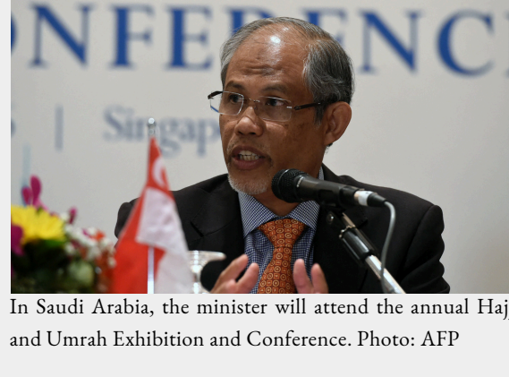
In Saudi Arabia, the minister will attend the annual Hajj and Umrah Exhibition and Conference.

Minister for Social and Family Development, Second Minister for Health and Minister-in-charge of Muslim Affairs Masagos Zulkifli (pictured) is in the region for an official trip, which will end on 15 January 2025. The visit aims to strengthen Singapore's bilateral engagements with Egypt and Saudi Arabia for future collaborations.