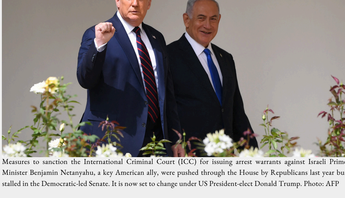
Measures to sanction the International Criminal Court (ICC) for issuing arrest warrants against Israeli Prime Minister Benjamin Netanyahu, a key American ally, were pushed through the House by Republicans last year but stalled in the Democratic-led Senate. It is now set to change under US President-elect Donald Trump.