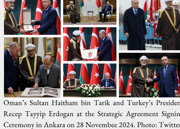
Oman's Sultan Haitham bin Tarik and Turkey's President Recep Tayyip Erdogan at the Strategic Agreement Signing Ceremony in Ankara on 28 November 2024.

Ankara and Muscat signed a Memorandum of Understanding (MOU) on cooperation in the fields of agriculture, livestock, fisheries, and water. Turkish President Recep Tayyip Erdogan announced plans to increase trade with Oman to US$5 billion, reflecting their potential, and emphasised the growing economic ties between the two countries. "Starting in 2025, with liquefied gas supplies from Oman, we will enter a new phase in our cooperation", he added.