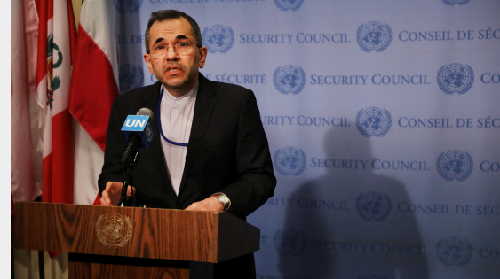
The talks aim to end a two-year hiatus with no direct negotiations on the lapsed nuclear deal.

Iran's Deputy Foreign Minister Majid Takht-Ravanchi (pictured) is in Geneva to meet his European counterparts following the collapse of a deal last week. Under the proposed agreement, Tehran would have limited its uranium enrichment to 60% purity. Tehran viewed the offer as a first step towards rebuilding trust with the West regarding its civilian nuclear programme.