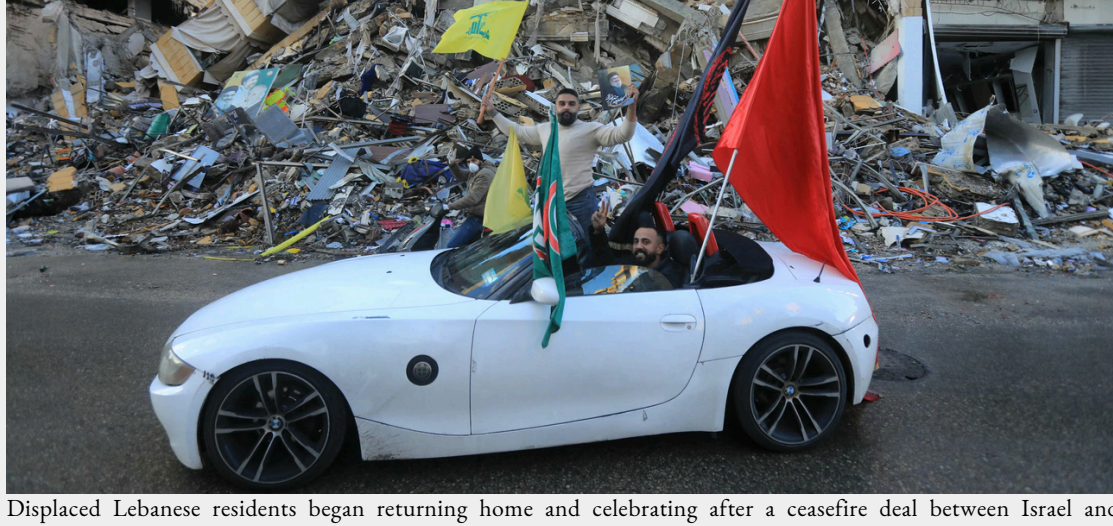
Displaced Lebanese residents began returning home and celebrating after a ceasefire deal between Israel and Hezbollah, brokered by the US and France, took effect. However, Israeli Prime Minister Benjamin Netanyahu later warned that Tel Aviv would not hesitate to strike if Hezbollah breaks any part of the agreed deal.