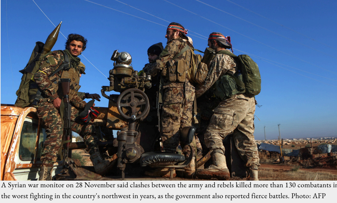
A Syrian war monitor on 28 November said clashes between the army and rebels killed more than 130 combatants in the worst fighting in the country's northwest in years, as the government also reported fierce battles.

Fighters from various rebel factions, including a group linked to Al Qaeda called Hayat Tahrir al-Sham, advanced by Wednesday to within about six miles of Aleppo and took over weapons and vehicles previously held by forces loyal to the government of President Bashar al-Assad.