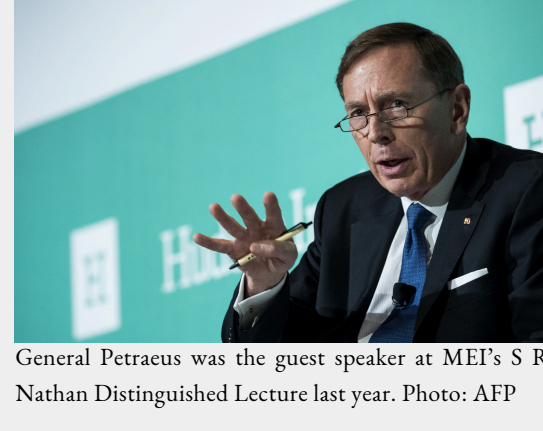
General Petraeus was the guest speaker at MEI's S R Nathan Distinguished Lecture last year.