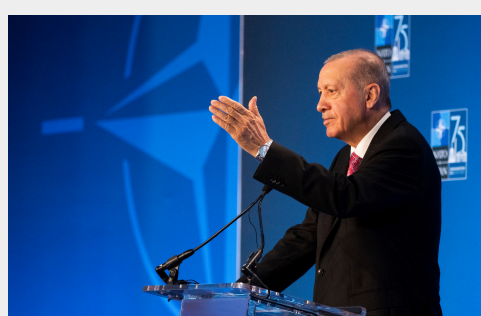
“I still have hope that we can come together and hopefully put Syria-Turkey relations back on track”, said the Turkish President.

Speaking to journalists on his return from trips to Saudi Arabia and Azerbaijan, Turkish President Recep Tayyip Erdogan said he believes a normalisation of ties would help stabilise Syria and protect its “territorial integrity”. He added that a reconciliation can end more than a decade of tensions between both neighbouring countries.