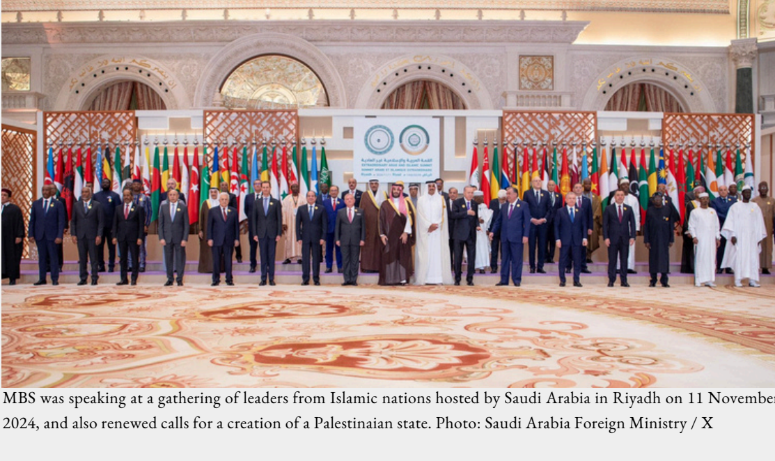
MBS was speaking at a gathering of leaders from Islamic nations hosted by Saudi Arabia in Riyadh on 11 November 2024, and also renewed calls for a creation of a Palestinian state.

In some of the harshest public criticism of Israel by a Saudi official since the start of the war, Crown Prince Mohammad Bin Salman condemned Tel Aviv’s actions in Gaza, and its attacks on Lebanon and Iran. He also warned Tel Aviv against launching attacks on Tehran.