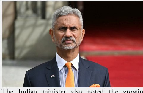
The Indian minister also noted the growing cultural and educational exchanges, including the launch of the new Symbiosis campus.

Indian External Affairs Minister S Jaishankar highlighted the growing strength of India-UAE relations, stating that the two countries are now in an “era of new milestones”. Speaking at the launch of Symbiosis International University’s new campus in Dubai on Thursday, Mr Jaishankar praised the increasing collaboration between both nations across a wide range of sectors, including fintech, renewable energy, infrastructure, and defence.