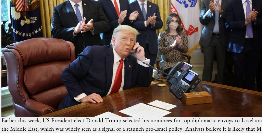
Earlier this week, US President-elect Donald Trump selected his nominees for top diplomatic envoys to Israel and the Middle East, which was widely seen as a signal of a staunch pro-Israel policy. Analysts believe it is likely that Mr Trump will make US foreign policy more favourable to Tel Aviv when he takes office in two months.