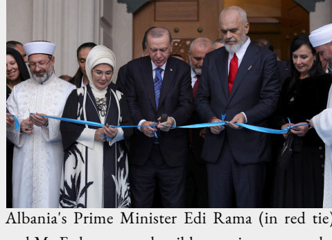
Albania’s Prime Minister Edi Rama (in red tie) and Mr Erdogan cut the ribbon to inaugurate the mosque of Namazjnah during its opening ceremony in Tirana.

After visiting Albania, Turkish President Recep Tayyip Erdogan will travel to Serbia as he seeks to strengthen ties with a region that was once ruled by the Ottoman Empire.