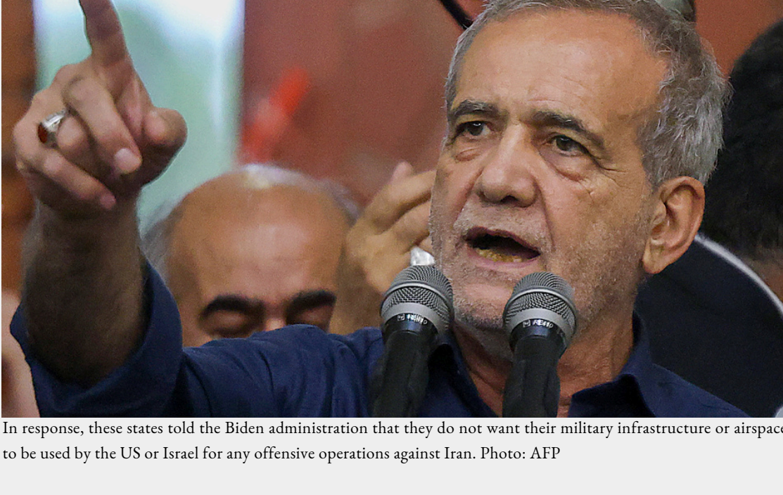
In response, these states told the Biden administration that they do not want their military infrastructure or airspace to be used by the US or Israel for any offensive operations against Iran.

Iran threatened to target the Arab Gulf states and other American allies in the Middle East if their territories or airspace are used for an attack on the Islamic Republic. Arab officials said these countries include Jordan, the UAE, Saudi Arabia and Qatar, all of which host US troops.