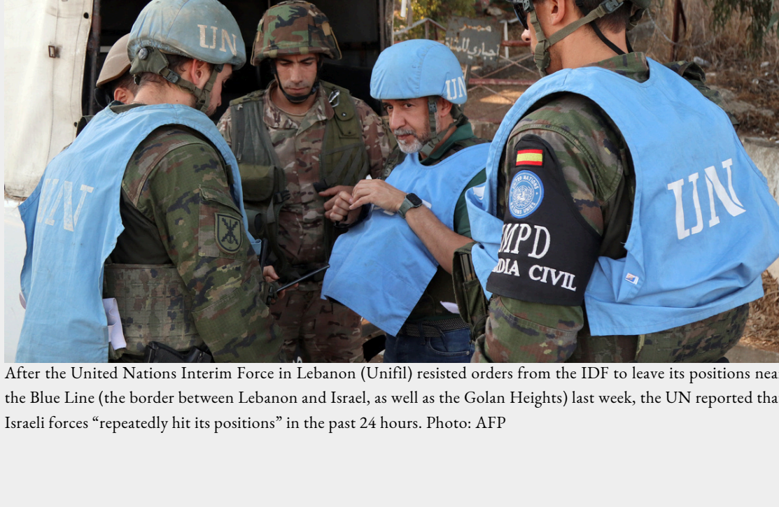
After the United Nations Interim Force in Lebanon (Unifil) resisted orders from the IDF to leave its positions near the Blue Line (the border between Lebanon and Israel, as well as the Golan Heights) last week, the UN reported that Israeli forces “repeatedly hit its positions” in the past 24 hours.