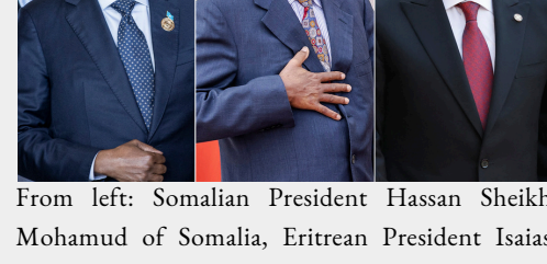
From left: Somalian President Hassan Sheikh Mohamud of Somalia, Eritrean President Isaias Afwerki and Egyptian President Abdel Fattah El-Sisi met in Asmara.

The leaders of each nation pledged Thursday to work together on regional security at an unprecedented summit held against a backdrop of heightened tensions in the Horn of Africa.