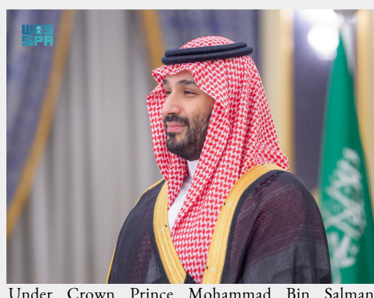
Under Crown Prince Mohammad Bin Salman, Riyadh enacted several reforms such as lifting the ban on women driving, among others.

The third session of the series will assess the progress and challenges of Riyadh's 'Vision 2030' plan and examine the geopolitical impacts of pursuing its economic goals. This event will be conducted on Wednesday, 18 September 2024, from 6pm to 7.30pm (SGT). To sign up, click here .