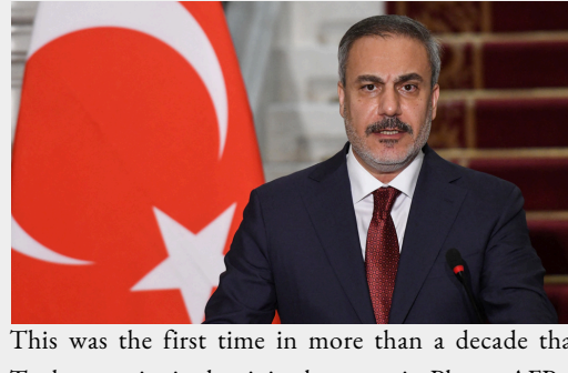
This was the first time in more than a decade that Turkey was invited to join the summit.

Turkish Foreign Minister Hakan Fidan (pictured) called for unity against Tel Aviv during the 162nd Arab League Counciling of Israeli Prime Minister in Cairo, while condemning Israeli Prime Minister Benjamin Netanyahu over the Gaza conflict.