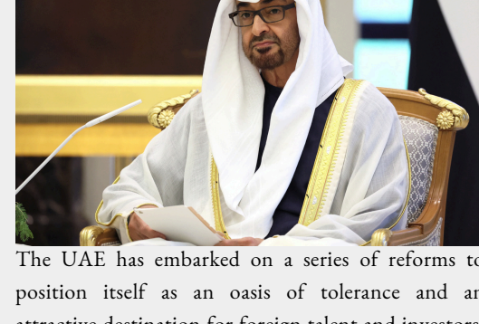
The UAE has embarked on a series of reforms to position itself as an oasis of tolerance and an attractive destination for foreign talent and investors.

If you missed part two of the ME 101 Lecture Series on Abu Dhabi's economic transformations, catch up with the video recap and podcast. Discover whether the UAE is setting the pace and revisit key discussions by clicking here .