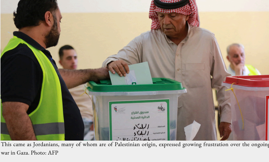
This came as Jordanians, many of whom are of Palestinian origin, expressed growing frustration over the ongoing war in Gaza.

The Islamic Action Front (IAF), an offshoot of the Muslim Brotherhood in Jordan, tripled its seats in the House of Representatives. This became the party's largest representation in Parliament since 1989, when it gained 22 out of 80 seats.