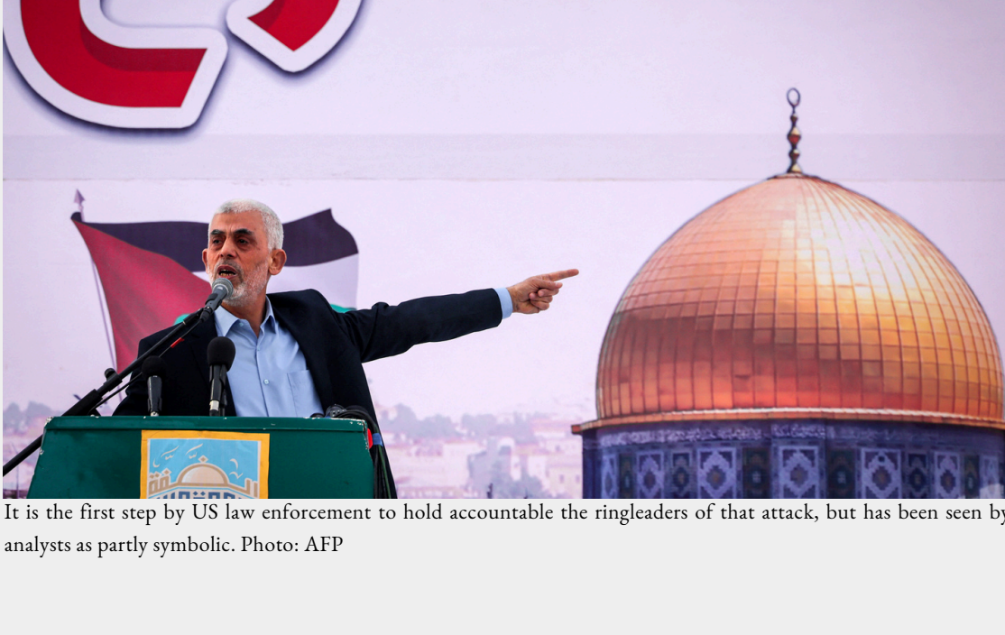
It is the first step by US law enforcement to hold accountable the ringleaders of that attack, but has been seen by analysts as partly symbolic.

The Justice Department announced indictments against six Hamas members on seven charges, including the murder of US citizens, conspiracy to finance terrorism, and use of weapons of mass destruction. Among them is Hamas leader Yahya Sinwar.