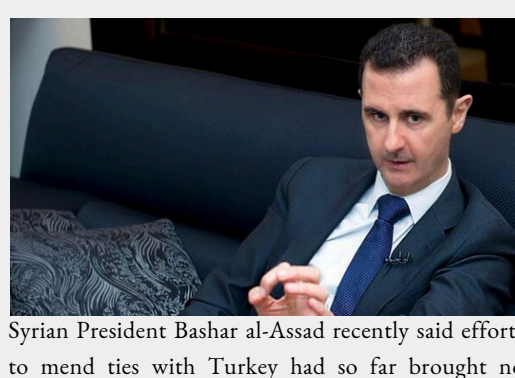
Syrian President Bashar al-Assad recently said efforts to mend ties with Turkey had so far brought no tangible results.

Russian Foreign Minister Sergei Lavrov announced that the four nations are planning to hold a high-level meeting soon to discuss the normalisation of relations between Ankara and Damascus. This meeting is expected to build on earlier discussions aimed at easing tensions between Turkey and Syria.