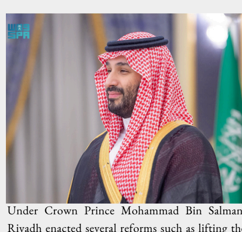
Under Crown Prince Mohammad Bin Salman, Riyadh enacted several reforms such as lifting the ban on women driving, among others.

The third session of the series will evaluate the progress and challenges of Riyadh's Vision 2030 plan and explore the geopolitical implications of pursuing the economic objectives under the initiative. This event will be conducted on Wednesday, 18 September 2024, from 6pm to 7.30pm (SGT). To sign up, click here .