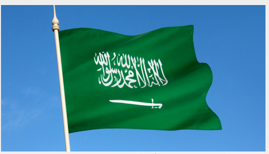
Other sources say that a total of 800 Chinese language teachers will be sent to Riyadh overall.

A total of 175 Chinese language teachers for primary and middle schools will begin their careers in Saudi Arabia in mid August. They will become the first batch of Mandarin teachers to serve in the Gulf nation, honouring an agreement on enhancing cooperation in Chinese language education that the two countries made last year.