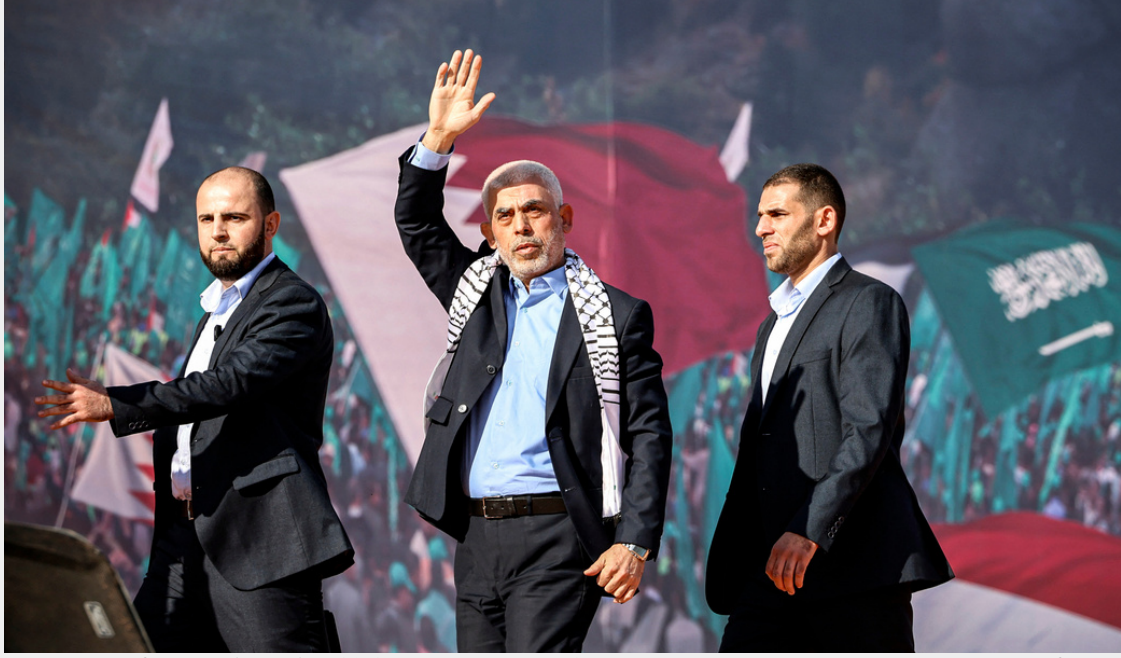
The choice of Sinwar (centre) is likely to be seen by Tel Aviv as a provocative move, and threatens to further complicate stalled US-led efforts to broker a deal to secure the release of hostages and end the war in Gaza.

Yahya Sinwar was appointed the new chief of the militant group's political bureau after the assassination of its former leader. The selection consolidates authority in the hands of a hardliner who is Israel's most wanted man.