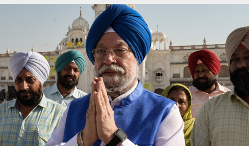
Sources said Mr Puri will attend Gastech 2024 in Houston, where he will hold talks with US energy giants, before heading to Abu Dhabi.

The nation's Minister of Petroleum and Natural Gas Hardeep Singh Puri (in picture) is set to visit Washington and Abu Dhabi in the coming months for major energy events. The goal is to enhance India's energy diplomacy, diversify supply sources, and secure long-term oil and gas contracts.