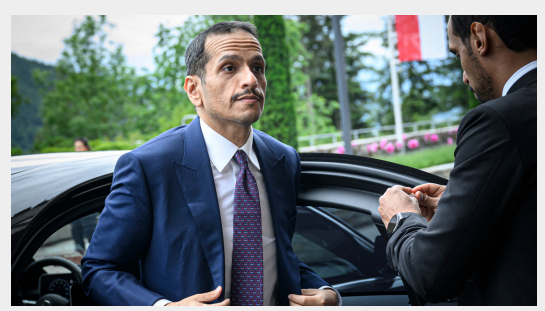
Mr Sheikh Mohammed's visit would come as Doha continues to play a crucial mediation role alongside Cairo and Washington in hopes of reaching a cease-fire in the Gaza Strip.

Qatar's Prime Minister Sheikh Mohammed bin Abdulrahman Al Thani is scheduled to consult with Iranian officials, including its Foreign Minister Abbas Araqchi, on bilateral and important regional issues", reported news sources in Tehran.