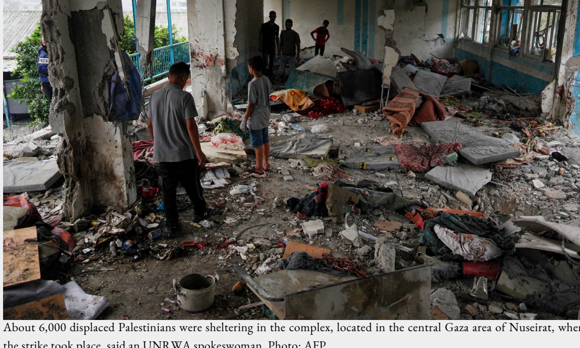
About 6,000 displaced Palestinians were sheltering in the complex, located in the central Gaza area of Nuseirat, when the strike took place, said an UNRWA spokeswoman.

The Gazan health ministry reported that 40 people, including women and children, were killed in the strike on the school compound operated by the United Nations Relief and Works Agency. Israel's military defended the strike, stating that militants were hiding inside three classrooms.