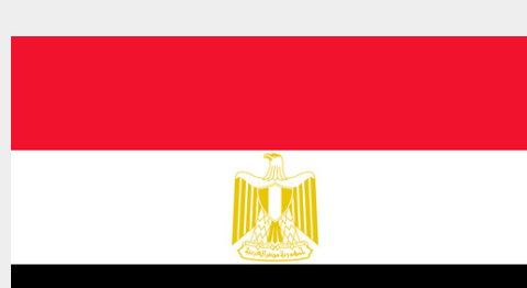
Egypt has spent billions of dollars building facilities, stadiums and sports cities, in recent years as part of its plans to modernise the country.

Cairo will take its biggest ever delegation to the Paris Olympics with the hope of exceeding its record medal haul from three years ago, and continue to build its credentials for a possible tilt at hosting the Summer Games in 2036.