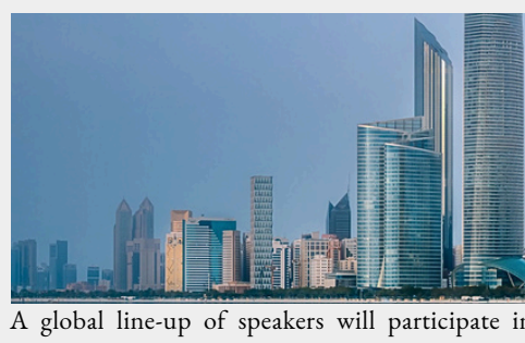
A global line-up of speakers will participate in discussions across three panels, covering themes such as the role of women in advancing the reform agenda in the region, among others.

The countdown to MEI's flagship event has begun! The conference will explore whether Gulf education systems can meet the demands of a knowledge-based economy, and the role of social and cultural reforms in producing a workforce for the future. It will be conducted both in person and online via Zoom, on Tuesday, 25 June 2024 from 9am to 4pm (SGT), at the Orchard Hotel. To sign up, click here .