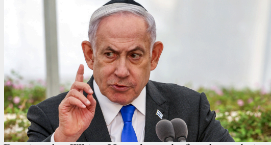
Despite the White House's push for de-escalation, Israeli Prime Minister Benjamin Netanyahu stated that the military was ready for an intense operation in Lebanon if necessary.

After Hezbollah published a drone footage of surveillance over Haifa in an open threat, Israeli Foreign Minister Israel Katz threatened Hezbollah's destruction in a "total war". "We are very close to the moment when we will decide to change the rules of the game against Hezbollah and Lebanon", said Mr Katz.