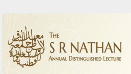
The aim of the S R Nathan Distinguished Lecture is to provide greater awareness and understanding of the modern Middle East.

Attending the S R Nathan Lecture? Things to note: Your email confirmation slip is a must for entry. No walk-ins, or same-day registrations will be allowed. Latecomers will also be turned away. The event will be held both in-person and remotely, on 13 December 2023 at 10am (SGT). For more details, click here .