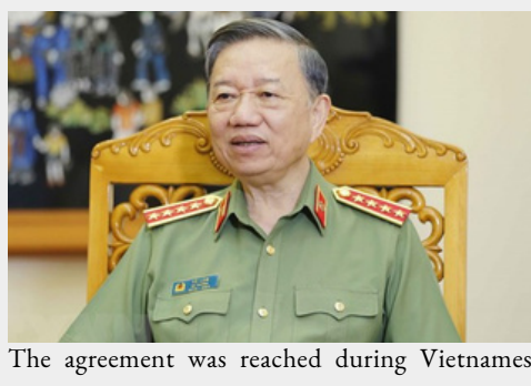
The agreement was reached during Vietnamese Minister of Public Security To Lam's trip to Egypt.

While they consented to organise the sixth meeting of the Vietnam-Egypt Joint Committee soon, both sides agreed to continue promoting collaboration, increase co-operation exchanges, and maintain bilateral co-operation mechanisms.