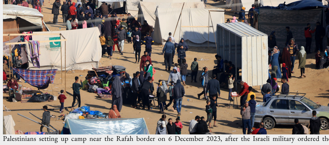
Palestinians setting up camp near the Rafah border on 6 December 2023, after the Israeli military ordered the evacuation of residents in the southern Gaza city of Khan Yunis.