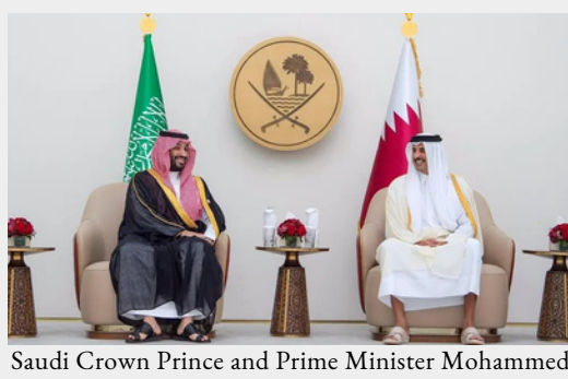
Saudi Crown Prince and Prime Minister Mohammed bin Salman was welcomed by Qatar's Emir Sheikh Tamim bin Hamad al-Thani upon his arrival in Doha for the 44th GCC summit and the seventh meeting of the Saudi-Qatari Coordination Council.

Saudi Arabia and Qatar signed a number of agreements and MOUs, including those for joint co-operation between the central banks of the two countries, and collaboration in the field of youth and sports affairs.