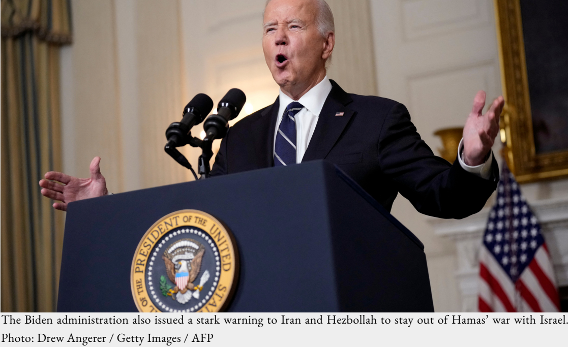
The Biden administration also issued a stark warning to Iran and Hezbollah to stay out of Hamas’ war with Israel.

The Pentagon announced that it was sending additional munitions to Israel and moving Navy warships closer to the nation in a show of support, as US President Joe Biden denounced Hamas’ attack as “terrorism”.