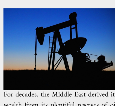
For decades, the Middle East derived its wealth from its plentiful reserves of oil and gas. But, how much longer?

Catch a recap of this ME 101 session, which discussed the current landscape of energy rent in the Middle East and the region’s potential transition to a post-oil era. Watch the full event or listen to the podcast by clicking here .