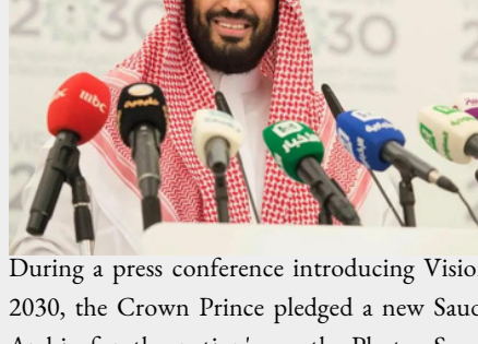
During a press conference introducing Vision 2030, the Crown Prince pledged a new Saudi Arabia for the nation’s youth.

Missed this session of the ME 101 lecture series, which delved into how women and youth are transforming education and workforce trends under Saudi Arabia’s Vision 2030? Fret not! Get up to speed on this insightful discussion by watching the full event or listening to the podcast by clicking here .