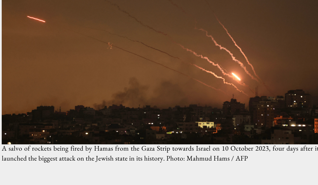
A salvo of rockets being fired by Hamas from the Gaza Strip towards Israel on 10 October 2023, four days after it launched the biggest attack on the Jewish state in its history.