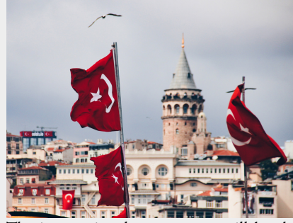
The prestigious sporting event Turkey has ever staged.

While Ankara secured its co-hosting role in the football tournament with Italy, Turkish Sports Minister Osman Askin Bak hints at the nation’s future aspirations to bid for hosting the Olympic.