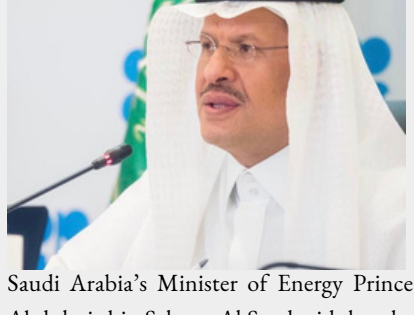
Saudi Arabia’s Minister of Energy Prince Abdulaziz bin Salman Al Saud said that the country will be launching a “credible, transparent and adaptable domestic market mechanism”.

Saudi Arabia is poised to commence trials for the region’s first hydrogen train next week, a significant step towards achieving its Vision 2030 objectives.