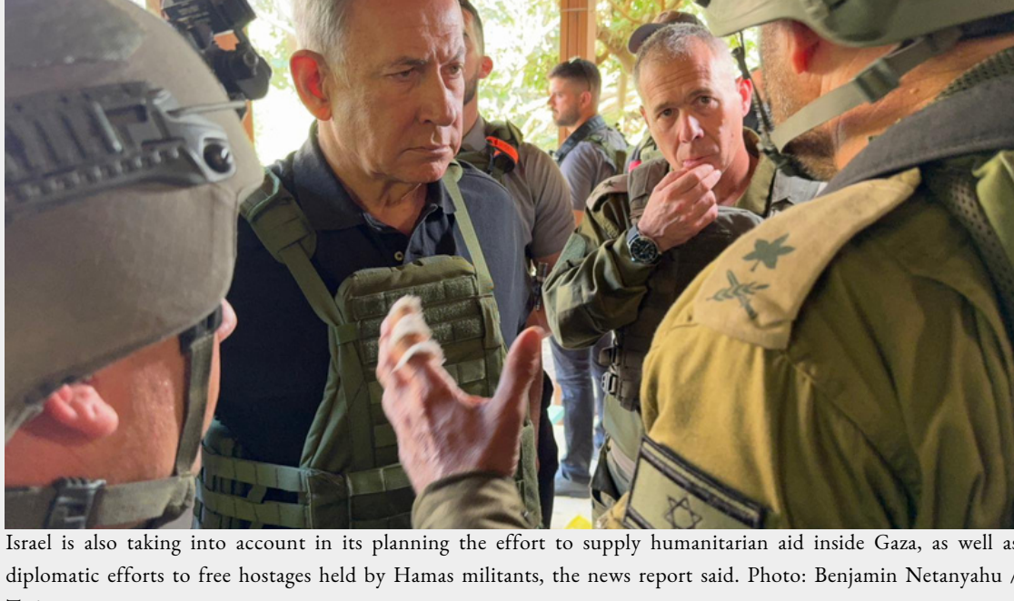
Israel is also taking into account in its planning the effort to supply humanitarian aid inside Gaza, as well as diplomatic efforts to free hostages held by Hamas militants, the news report said.

Anticipating threats to its forces once Israel launches its ground invasion of the Hamas-ruled Palestinian territory, the US persuaded Tel Aviv to hold off the incursion until air-defence systems can be placed in the region to protect its troops there.