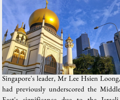
Singapore's leader, Mr Lee Hsien Loong, had previously underscored the Middle East's significance due to the Israeli-Palestinian issue's emotional impact on its Muslim population.