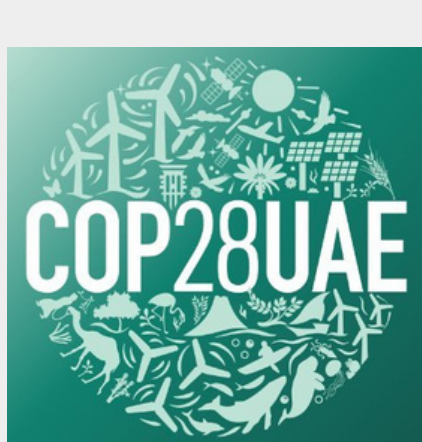
Abu Dhabi will be the fourth Arab country to host the climate summit, which will take place from 30 November to 10 December 2023.

What can we expect from the UAE as host of COP28? Can it steer global climate action in the right direction? Find out from a panel of experts in this webinar, hosted by MEI in collaboration with the UAE Embassy in Singapore, on 9 November 2023, from 4.00 pm to 5.30 pm (SGT). For more details and to sign up, click here .