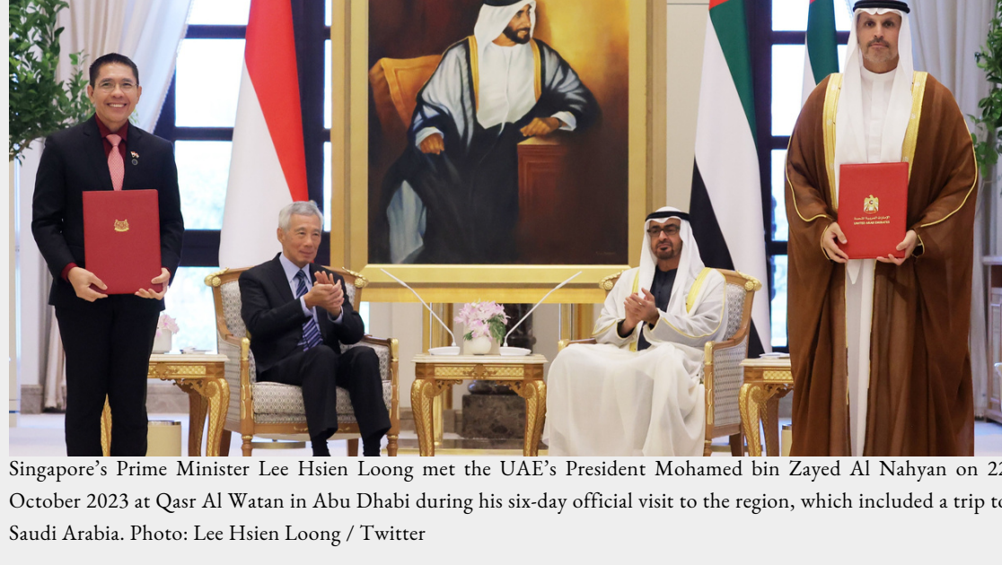
Singapore's Prime Minister Lee Hsien Loong met the UAE's President Mohamed bin Zayed Al Nahyan on 22 October 2023 at Qasr Al Watan in Abu Dhabi during his six-day official visit to the region, which included a trip to Saudi Arabia.