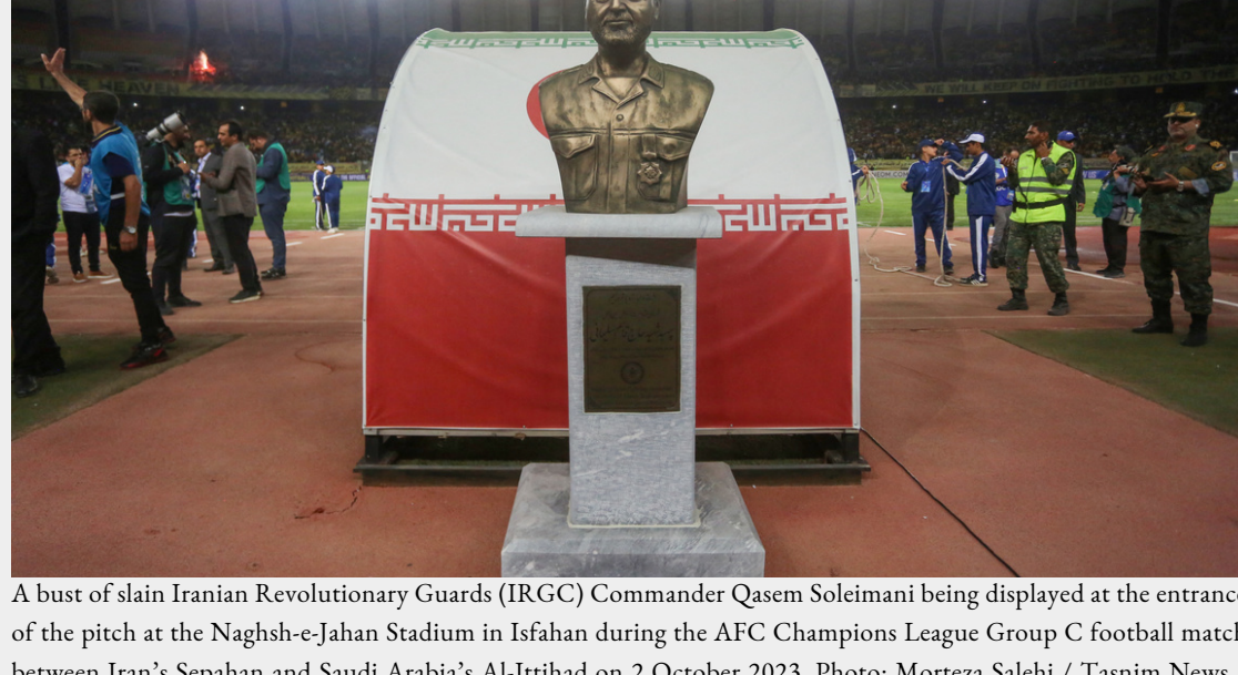
A bust of slain Iranian Revolutionary Guards (IRGC) Commander Qasem Soleimani being displayed at the entrance of the pitch at the Naghsh-e-Jahan Stadium in Isfahan during the AFC Champions League Group C football match between Iran's Sepahan and Saudi Arabia's Al-Ittihad on 2 October 2023.