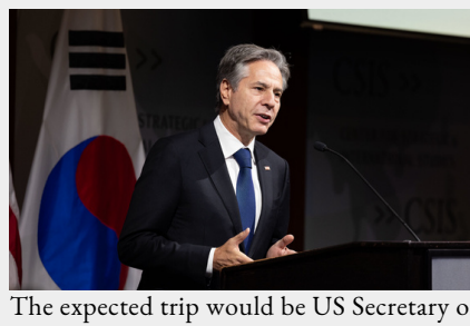
The expected trip would be US Secretary of State Antony Blinken's fourth visit to Israel since his appointment in January 2021.

US' top diplomat will also travel to the West Bank and Morocco in the third week of October as the Biden administration works to advance the brokering of a peace deal between Tel Aviv and Riyadh.