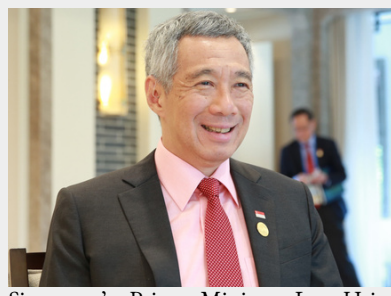
Singapore's Prime Minister Lee Hsien Loong had previously emphasised the Middle East's significance to the nation, given the emotional impact of the Israeli-Palestinian issue on its substantial Muslim population.