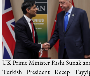
UK Prime Minister Rishi Sunak and Turkish President Recep Tayyip Erdogan agreed in July to explore closer collaboration in various areas.

London, through its export credit agency UK Export Finance (UKEF), is in talks to finance its third railway project in Ankara. The deal is expected to close soon, according to an insider source, though details remain undisclosed pending finalisation.