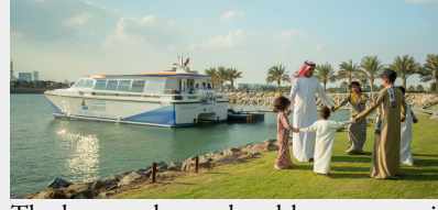
The lecture also explored how economic diversification, urbanisation, and shifting societal attitudes have impacted the traditional role of the family unit as a social anchor.

Didn't have a chance to catch the ME 101 lecture on the Gulf Arab states' socio-cultural evolution? We've got you covered! Dive into the recap through our video or podcast. Your exclusive access key to the lecture is right here!