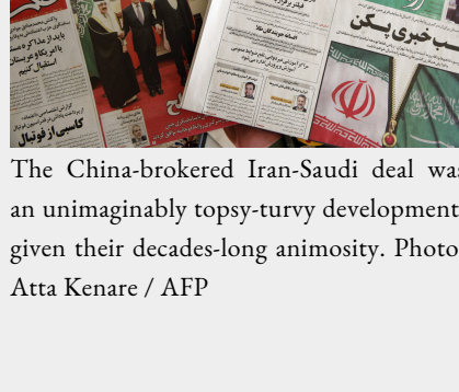
The China-brokered Iran-Saudi deal was an unimaginably topsy-turvy development, given their decades-long animosity.

How might Iran's regional diplomacy, including its China-brokered agreement with Saudi Arabia, influence other initiatives such as the US-led Abraham Accords, and potentially reshape the balance of external power in the Middle East? The second session of the ME 101 series unpacked these topics and beyond. Click here to catch up now with the full video or listen to the podcast – your backstage pass to this lecture!