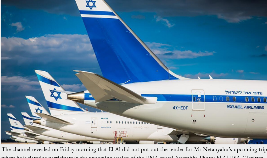
The channel revealed on Friday morning that El Al did not put out the tender for Mr Netanyahu's upcoming trip, where he is slated to participate in the upcoming session of the UN General Assembly.

According to reports from Israel's Channel 13, there is an unspoken agreement among pilots in the company's 777 fleet, most of whom are veterans of the nation's Air Force, not to volunteer to operate the flight for Prime Minister Benjamin Netanyahu and his wife.