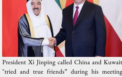
President Xi Jinping called China and Kuwait "tried and true friends" during his meeting with Kuwaiti Emir Sheikh Sabah Al-Ahmad Al-Jaber Al-Sabah (left) at the Great Hall of the People in 2018.

The visit, set to occur later this month as reported by the state news agency KUNA, is anticipated to include the signing of significant and essential agreements across various domains, thereby strengthening bilateral ties between the two nations.