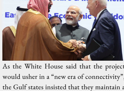
As the White House said that the project would usher in a "new era of connectivity", the Gulf states insisted that they maintain a balanced position across the board.

US President Joe Biden, alongside leaders from India, Saudi Arabia, and the UAE, introduced a new trade route connecting New Delhi to the Middle East and Europe via railways and ports. The trade route raises questions of whether it complements China's Belt and Road Initiative, or is it intended to compete with it?