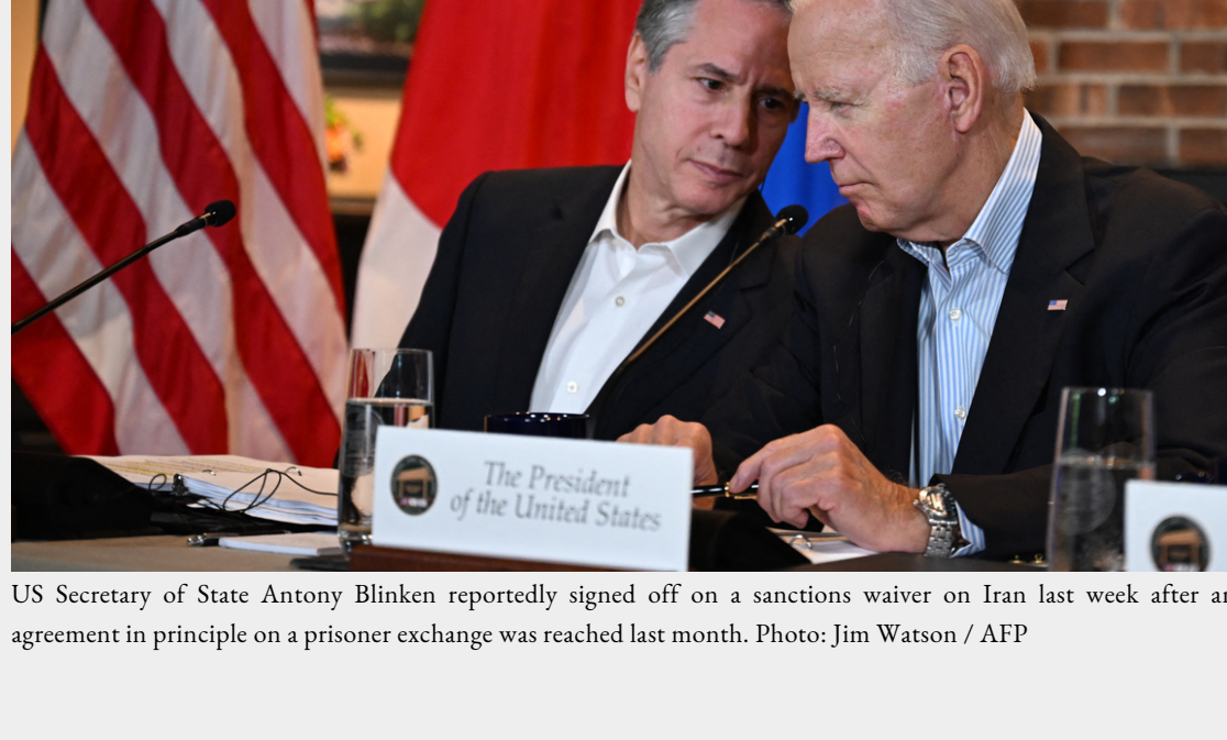
US Secretary of State Antony Blinken reportedly signed off on a sanctions waiver on Iran last week after an agreement in principle on a prisoner exchange was reached last month.