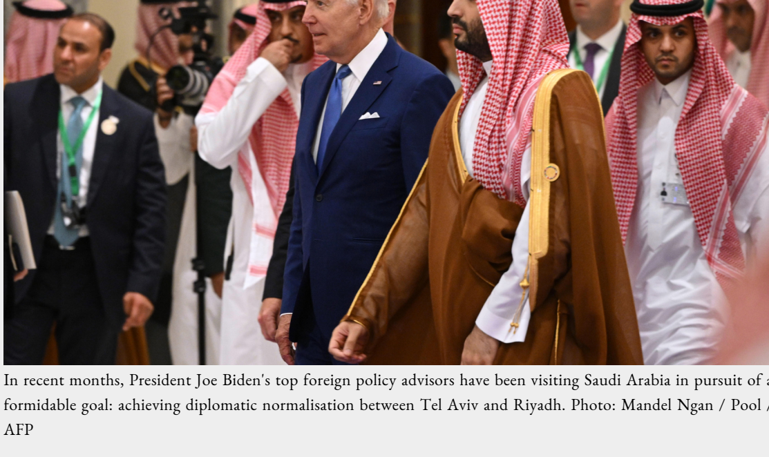
In recent months, President Joe Biden's top foreign policy advisors have been visiting Saudi Arabia in pursuit of a formidable goal: achieving diplomatic normalisation between Tel Aviv and Riyadh.