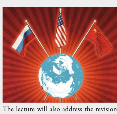
The lecture will also address the revision of strategies by regional powers like Saudi Arabia, Israel, and the UAE in response to the evolving "cold war" dynamics.