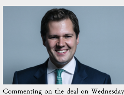
Commenting on the deal on Wednesday, UK Immigration Minister Robert Jenrick (in picture) described Ankara as "one of the most important" allies of London in efforts to prevent the flow of migrants.

On Wednesday, the United Kingdom declared that Ankara and London had entered into an agreement to enhance cooperation in addressing irregular migration caused by armed conflicts, instability, and economic challenges.