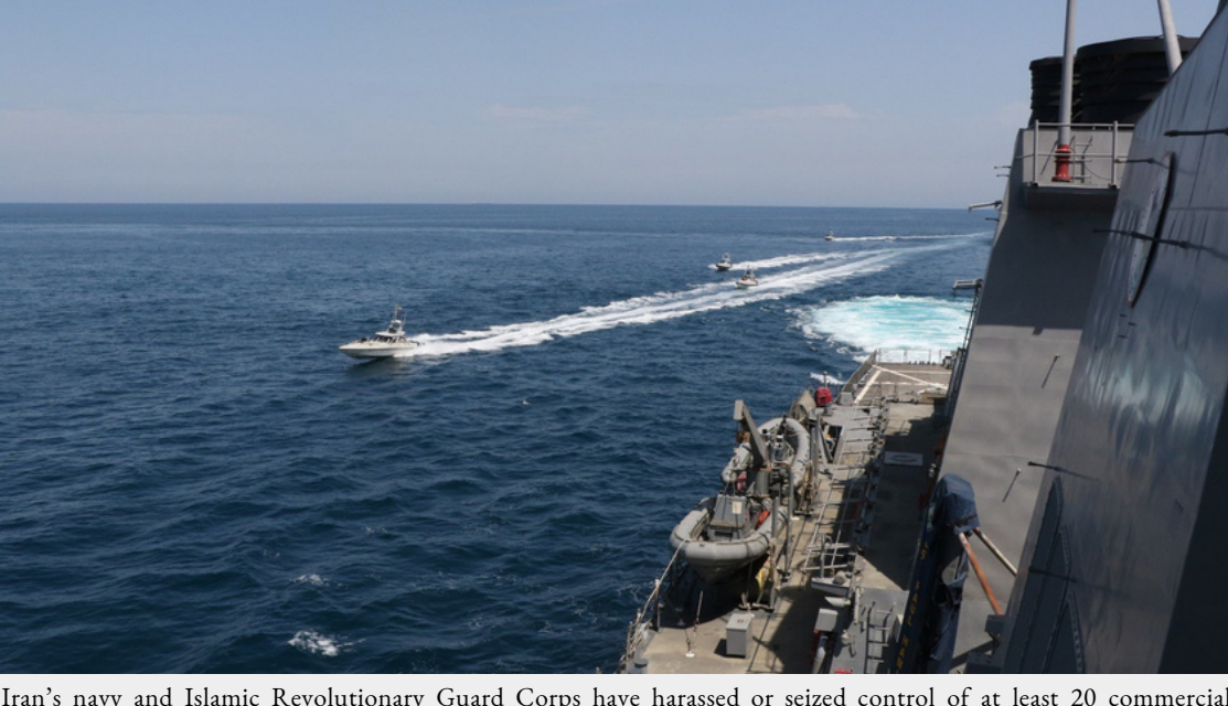
Iran's navy and Islamic Revolutionary Guard Corps have harassed or seized control of at least 20 commercial shipping tankers in the region over the past two years, according to the US 5th Fleet's numbers.

Over 3,000 US Navy personnel and Marines entered the Suez Canal to address potential Iranian threats to commercial tankers in the Persian Gulf. The Marines' exact role in deterring Iran and protecting neighbouring Arab states remains unspecified by the White House.