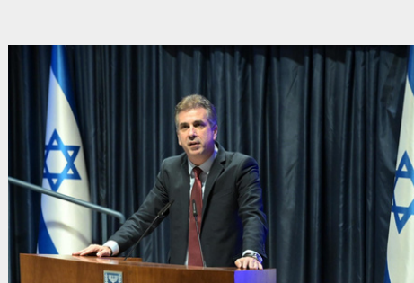
The Minister's (in picture) meeting in the Gulf nation was previously rumoured to be delayed due to National Security Minister Itamar Ben-Gvir's presence at the Temple Mount, leading to condemnations in the Arab world.

Israel's Foreign Minister Eli Cohen will have his first public meeting in the Gulf state in September, with an itinerary that also includes a trip to another Muslim-majority nation, Albania.