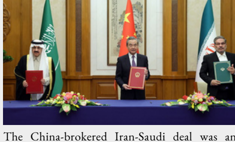
The China-brokered Iran-Saudi deal was an unimaginably topsy-turvy development, given their decades-long animosity.