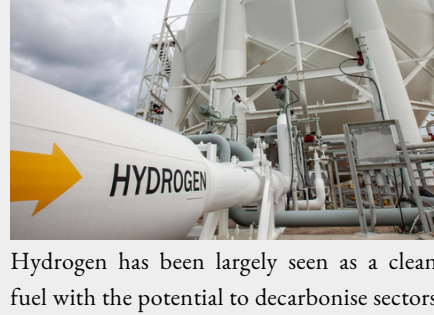
Hydrogen has been largely seen as a clean fuel with the potential to decarbonise sectors such as transportation and industry, curbing global warming.

On 18 July 2023, MEI held a webinar on hydrogen development in the Gulf and South-East Asia. If you missed it, don't fret – we have you covered! Watch the entire webinar or listen to the podcast by clicking here .