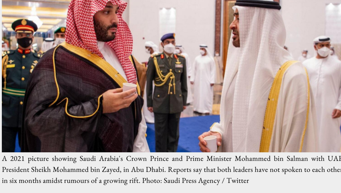
A 2021 picture showing Saudi Arabia's Crown Prince and Prime Minister Mohammed bin Salman with UAE President Sheikh Mohammed bin Zayed, in Abu Dhabi. Reports say that both leaders have not spoken to each other in six months amidst rumours of a growing rift.