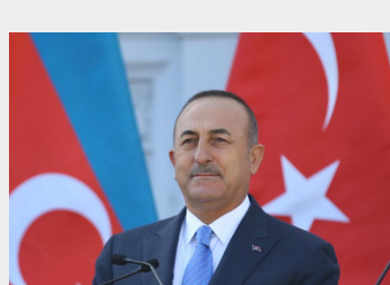
Back in March, Turkish Foreign Minister Mevlut Cavusoglu (in picture) described relations between Turkey and Egypt as "historic" with a basis in a common culture.

Egypt's Minister of Military Production Mohamed Salah Eddin Mustafa has invited Turkey to join the largest military event held in the country, the Egypt Defense Expo (EDEX), scheduled for December. Both nations also discussed fostering collaboration between their respective military production companies and Turkish firms in various manufacturing fields.