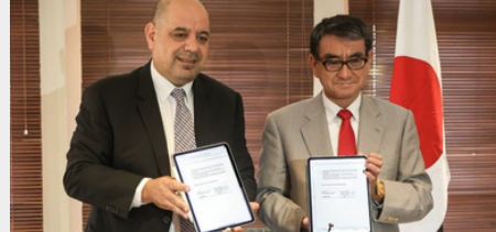
Jordan's Minister of Digital Economy and Entrepreneurship Ahmed Hanandeh (left) and Japan's Minister for Digital Transformation Kono Taro (right) after the signing of the MOU on Tuesday.

Officials stated that under the agreement, both countries will collaborate to enhance opportunities in digital transformation, information technology, and innovation.