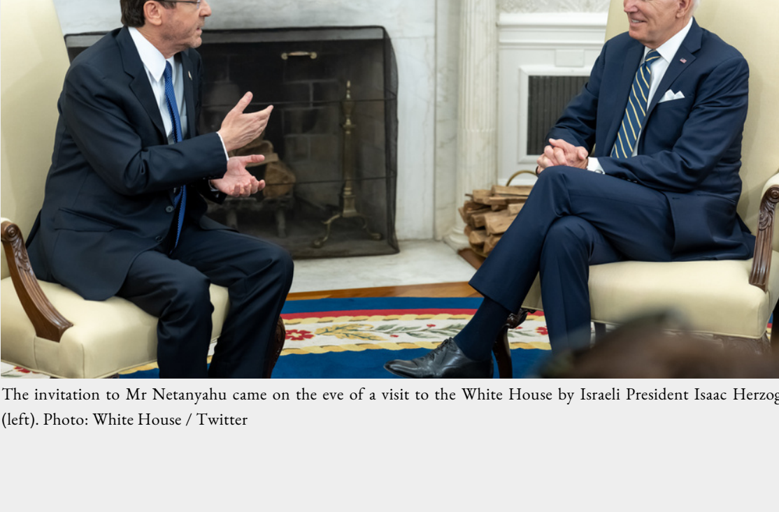
The invitation to Mr Netanyahu came on the eve of a visit to the White House by Israeli President Isaac Herzog (left).

White House officials clarified that the invitation does not signify a change in President Joe Biden's objections to some of Israeli Prime Minister Benjamin Netanyahu's hard-line positions, which critics see as a lack of a strong stance by the administration.