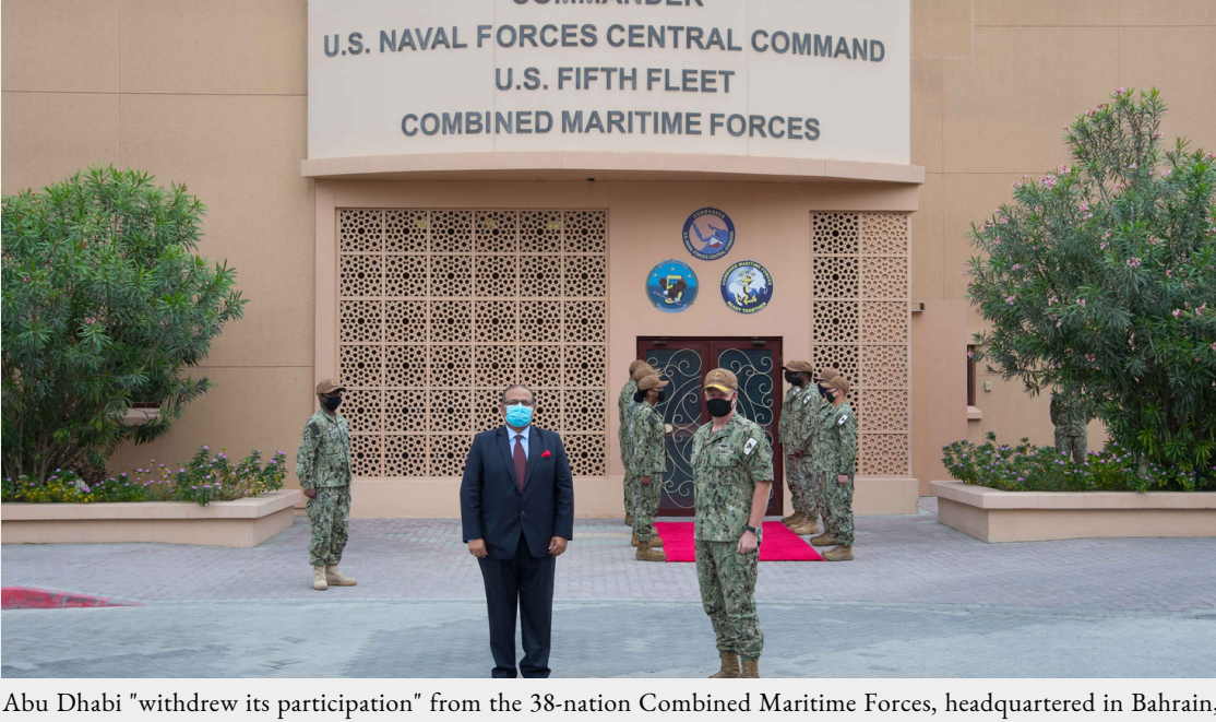
Abu Dhabi "withdrew its participation" from the 38-nation Combined Maritime Forces, headquartered in Bahrain, two months ago, according to a foreign ministry statement.

Political analysts say the Emiratis' latest move could be intended as a message to Washington that the country is displeased with the level of American protection for its allies in the Persian Gulf against threats from Iran, and must look out for its own interests.