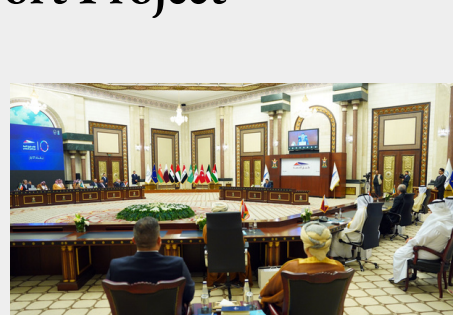
The plans were announced at a conference in Baghdad, at which transport ministers from the Gulf states, Turkey, Iran, Syria, and Jordan were present.

Iraqi Prime Minister Mohammed Shia al-Sudan said that the upcoming project would facilitate the movement of goods from the Gulf to Europe, and would be "an economic lifeline and a promising opportunity for the convergence of interests, history, and cultures".