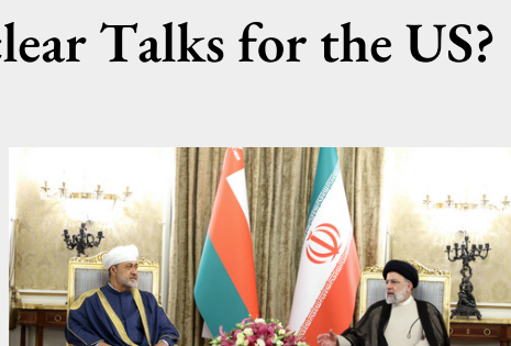
Oman's Sultan Haitham bin Tarik (L), whose nation is a long time mediator between the West and Tehran, with President Ebrahim Raisi of Iran during their meeting in Tehran last week.

Amidst conflicting reports, sources indicated that US officials reached out to Muscat to explore the revival of nuclear talks between Washington and Tehran.