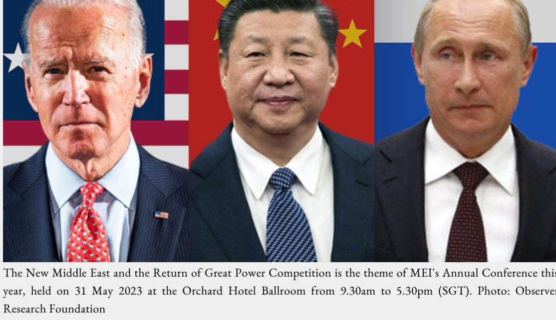
The New Middle East and the Return of Great Power Competition is the theme of MEI's Annual Conference this year, held on 31 May 2023 at the Orchard Hotel Ballroom from 9.30am to 5.30pm (SGT).