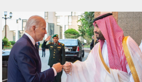
In July 2022, President Biden visited the Middle East to reaffirm US commitment to the region and advance Israeli-Arab normalisation.

Experts argue that four more years under President Joe Biden, who recently launched his campaign for re-election, will likely see continued attempts at US disengagement from the Middle East.