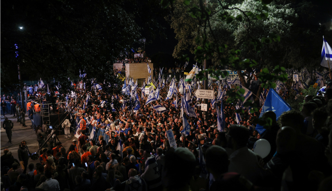
Pro-government protesters gathering near Israel's Parliament in Jerusalem on 27 April 2023, in support of the controversial push to overhaul the justice system.

Up to 200,000 people participated in what organisers dubbed the Million March, a defiant show of solidarity for the government that urged it to move forward with its plan for the judiciary and resist outside pressure.