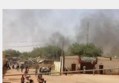
Sudan has been engulfed in civil war as a result of a power struggle between two military factions.

Despite being a popular destination for refugees fleeing violence, persecution, and economic hardships in nations throughout the Middle East and East Africa, many doubt Cairo's capacity to absorb large populations due to its financial troubles.