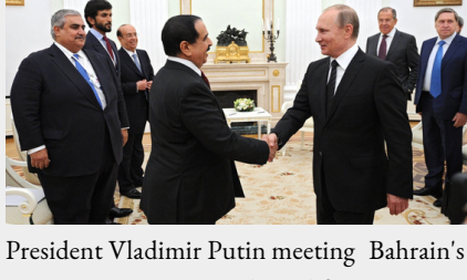
President Vladimir Putin meeting Bahrain's King Hamad bin Isa Al Khalifa in 2016, in Russia.

The foreign ministry announced on Monday that it is working on establishing visa-free travel agreements with a handful of Gulf states, including Saudi Arabia, Kuwait, Bahrain, and Oman, as well as Syria.