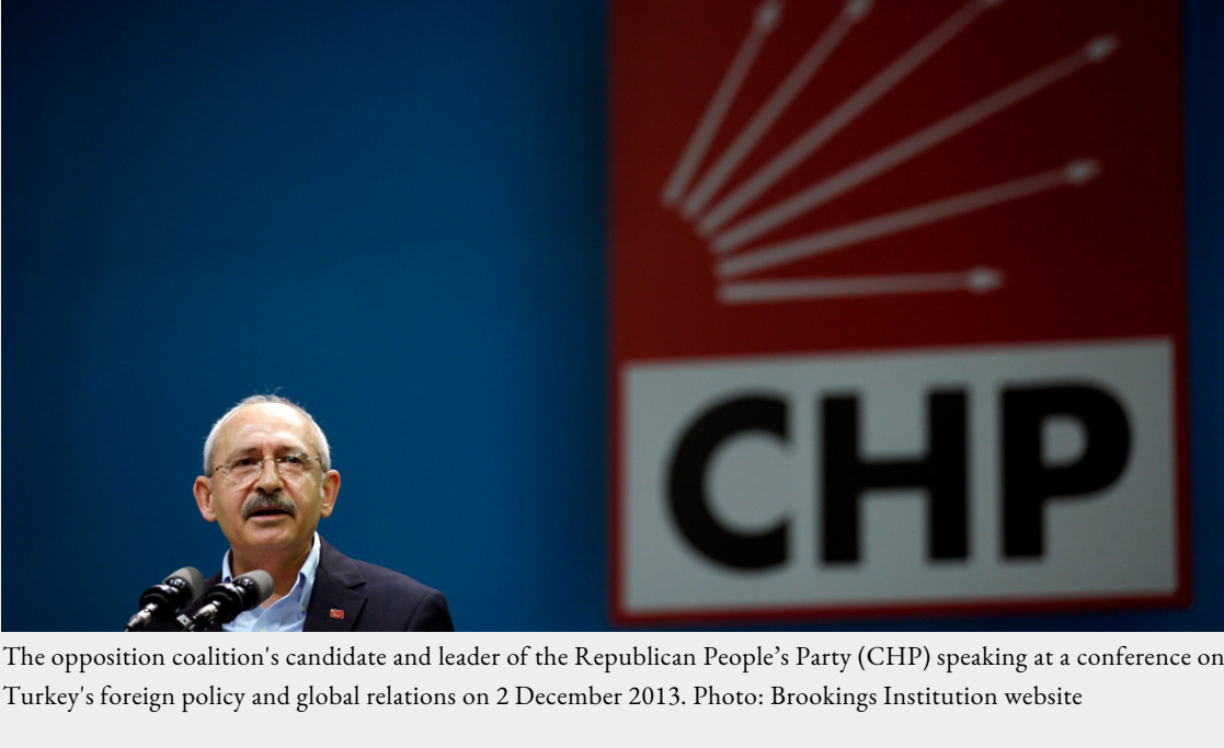
The opposition coalition's candidate and leader of the Republican People's Party (CHP) speaking at a conference on Turkey's foreign policy and global relations on 2 December 2013.

The head of Turkey's main opposition party, Mr. Kemal Kilicdaroglu, has been selected to challenge current President Recep Tayyip Erdogan. While critics of the incumbent see the election as the prime opportunity to remove him from power, reports indicate that the opposition coalition is in disarray.