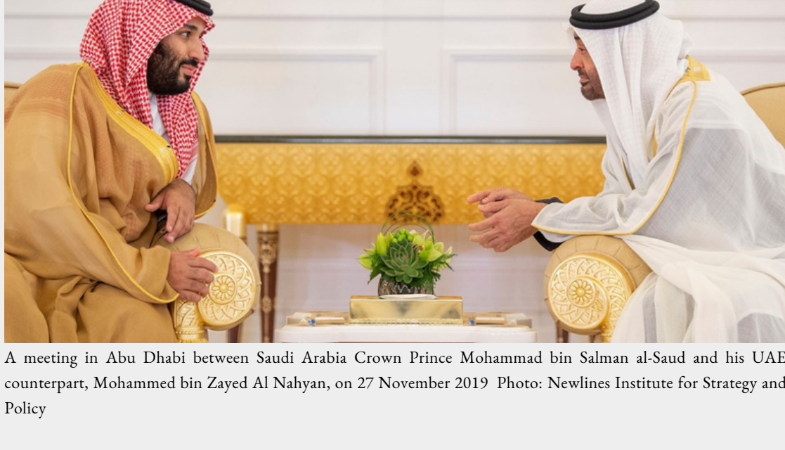
A meeting in Abu Dhabi between Saudi Arabia Crown Prince Mohammad bin Salman al-Saud and his UAE counterpart, Mohammed bin Zayed Al Nahyan, on 27 November 2019.