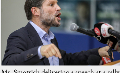
Mr. Smotrich delivering a speech at a rally in the southern Israeli city of Sderot on 26 October 2022.

Far-right Israeli Finance Minister Bezalel Smotrich's visa request has been approved by the US State Department after internal consultations following his controversial comments about "erasing" a Palestinian village.