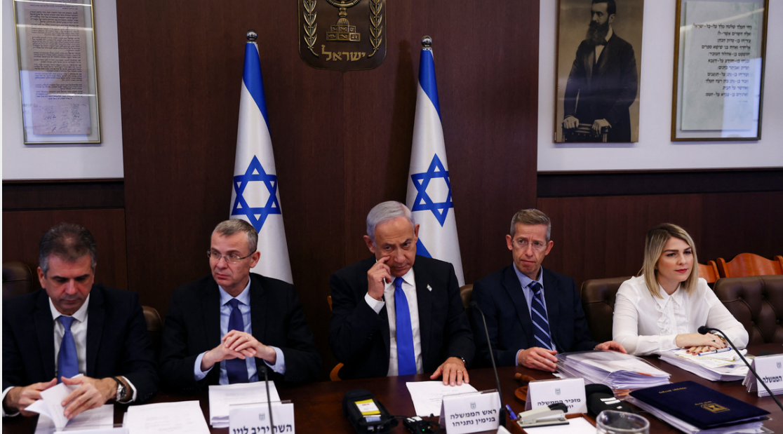
The Israeli premier in a Cabinet meeting at the prime minister's office in Jerusalem, on 23 February 2023.

The news of the rapprochement left Tel Aviv in shock and anxiety after hoping that shared fears about Iran would lead to ties with the Kingdom and a regional security alliance. This further exacerbated the sense of national peril caused by deep domestic divisions over Prime Minister Benjamin Netanyahu's policies.