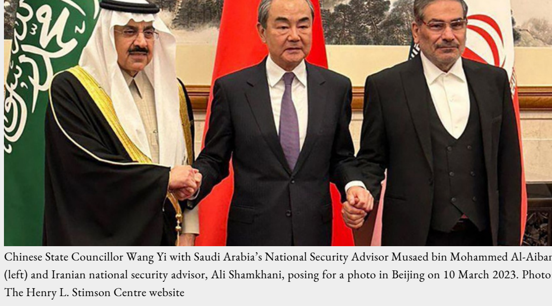
Chinese State Councillor Wang Yi with Saudi Arabia's National Security Advisor Musaed bin Mohammed Al-Aiban (left) and Iranian national security advisor, Ali Shamkhani, posing for a photo in Beijing on 10 March 2023.