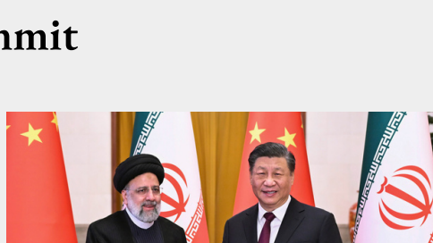
Chinese President Xi Jinping welcoming Iran President Ebrahim Raisi to Beijing on 14 February.

China wants to bring Tehran and its six Arab neighbours of the Gulf Cooperation Council together later this year for a regional summit. A successful dialogue between them would mark another diplomatic victory for China.