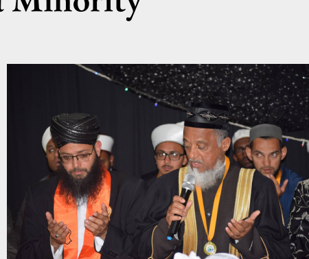
Muslim leaders during prayers in Cape Town.