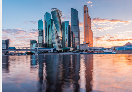
Moscow City.

The roadshow, to be held on 13 February at the Mandarin Oriental Hotel in Doha, aims to promote Moscow as a leading tourism and business destination.