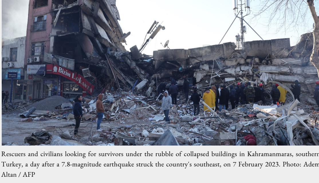
Rescuers and civilians looking for survivors under the rubble of collapsed buildings in Kahramanmaraş, southern Turkey, a day after a 7.8-magnitude earthquake struck the country's southeast, on 7 February 2023.