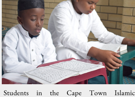
Students in the Cape Town Islamic Educational Centre (CTIEC) in South Africa.