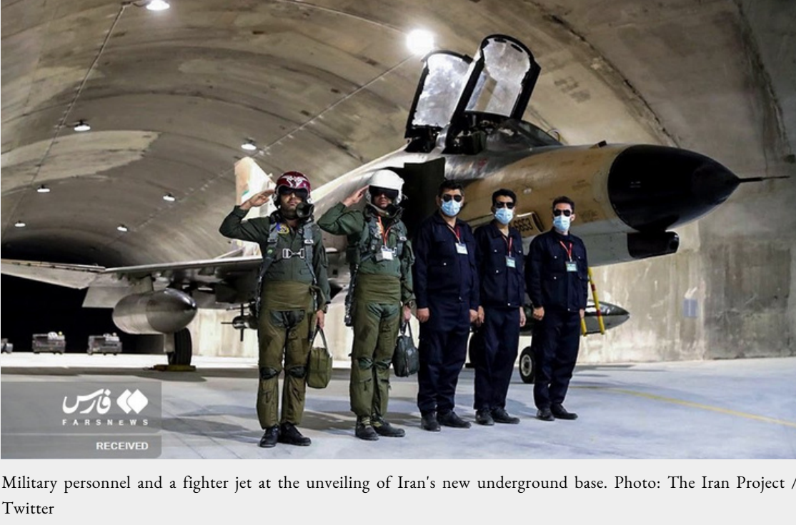
Military personnel and a fighter jet at the unveiling of Iran's new underground base.

Iran's state media reported on Tuesday that the base was designed to withstand possible strikes by US bunker-busting bombs and launch counter-offensives. Dubbed the Oghab (Eagle) 44, the base can house all types of fighter jets, bombers, and drones.