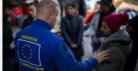
A member of the European Civil Protection and Humanitarian Aid Operations team assisting a quake victim.

The European Union will host the conference in Brussels on 16 March, as part of its efforts to mobilise funds in support of the people in Turkey and Syria affected by the devastating earthquakes.