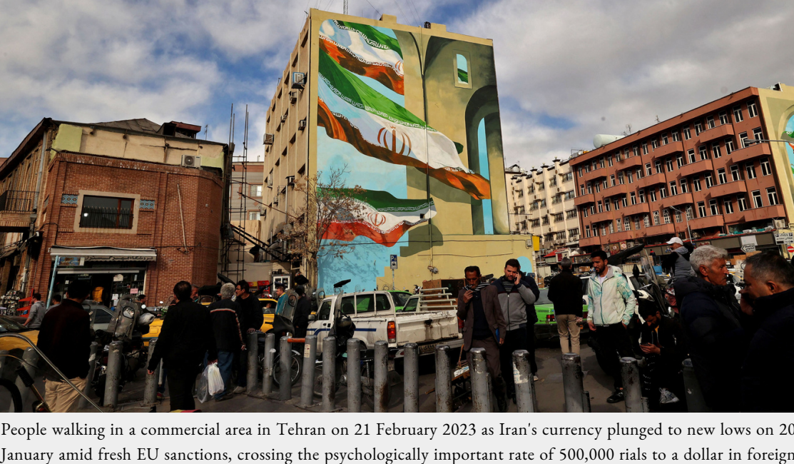
People walking in a commercial area in Tehran on 21 February 2023 as Iran's currency plunged to new lows on 20 January amid fresh EU sanctions, crossing the psychologically important rate of 500,000 rials to a dollar in foreign exchange markets.

Sanctions were imposed on several military companies as well as ministers and lawmakers, both at a national level and in the European Parliament. The French Minister for Gender, Equality, Diversity, and Equal Opportunities, Isabelle Rome, is among those sanctioned.