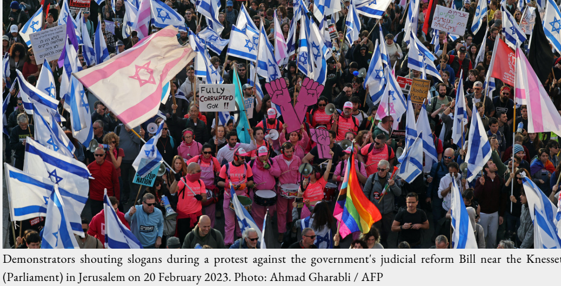
Demonstrators shouting slogans during a protest against the government's judicial reform Bill near the Knesset (Parliament) in Jerusalem on 20 February 2023.