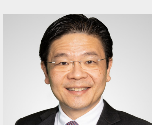
Singapore's Deputy Prime Minister Lawrence Wong

This event will be conducted both in-person and online via Zoom on Tuesday, 13 December, at 11:00am (SGT). Click here to sign up now.