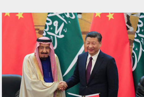
King of Saudi Arabia, Salman bin Abdulaziz Al Saud, and China President Xi Jinping during a signing ceremony at the Great Hall of the People in Beijing, China.

In early December, Saudi Arabia will host the first-ever Chinese-Arab summit. The Chinese consul-general in Dubai pointed out that relations between China and Arab countries, including the UAE, are improving rapidly.