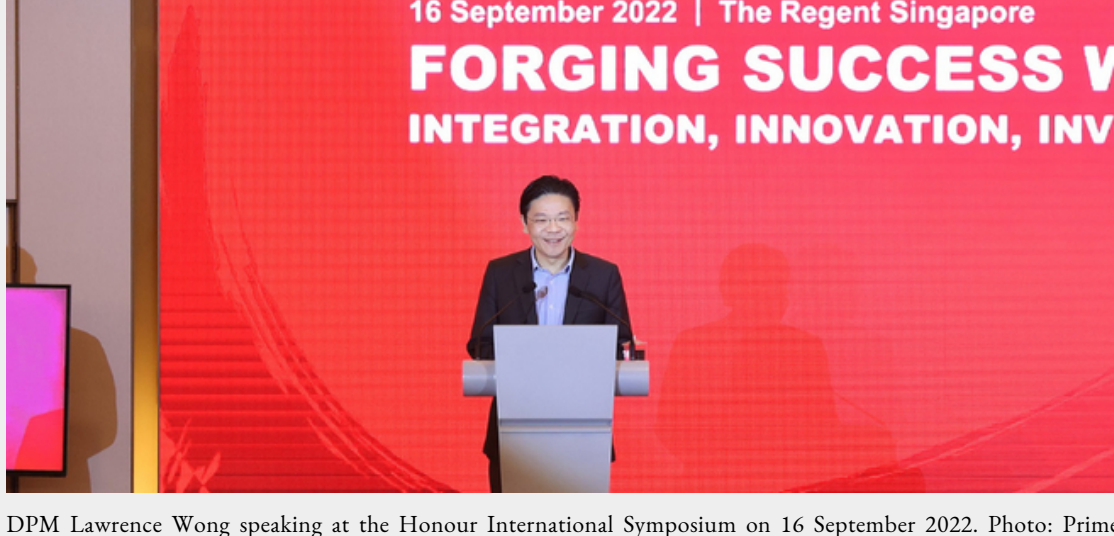
DPM Lawrence Wong speaking at the Honour International Symposium on 16 September 2022.