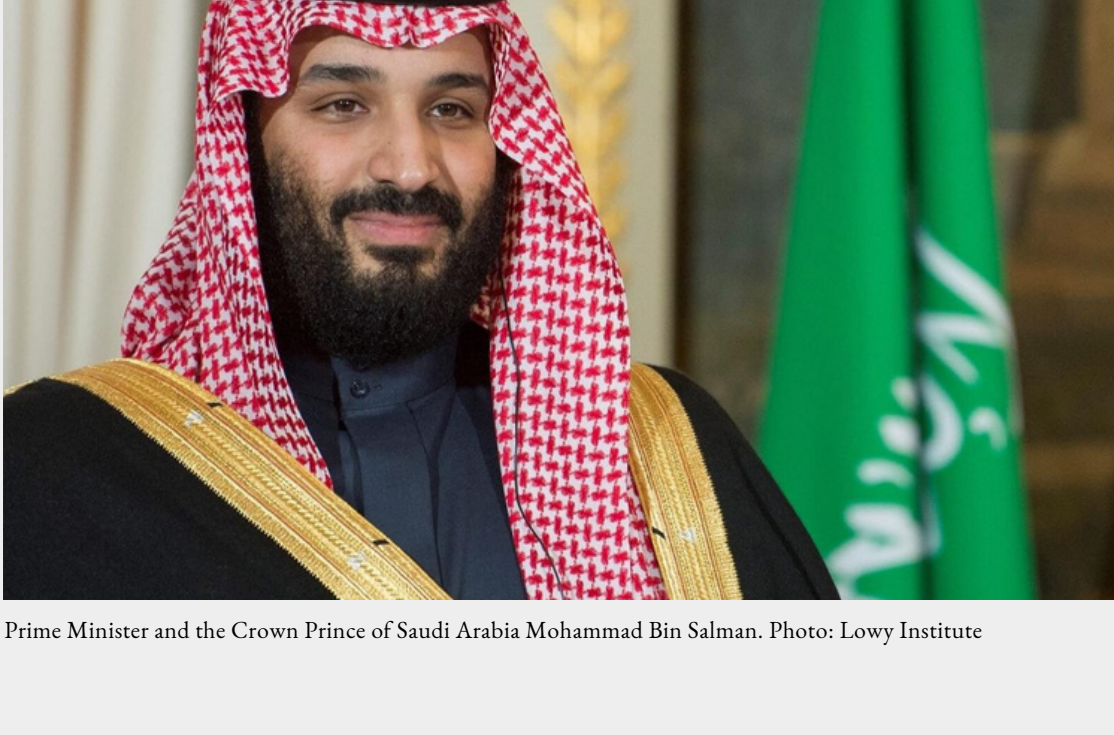
Prime Minister and the Crown Prince of Saudi Arabia Mohammad Bin Salman.

On Tuesday, the Saudi Cabinet praised the Crown Prince's announcement to build one of the world's largest airports in the Kingdom. As Riyadh seeks to become a global hub for trade and tourism, the project will provide a major boost for its ambitions.