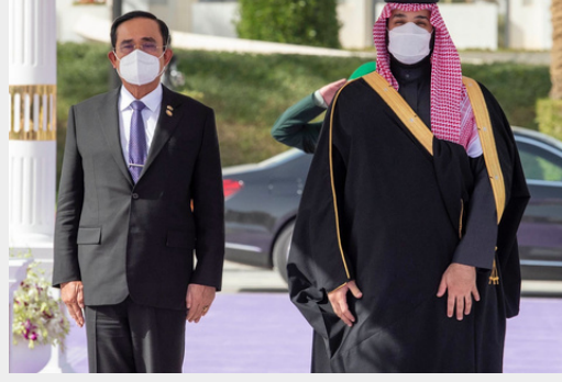
The Prime Minister of Thailand, General Prayut Chan-o-cha (Ret), and the Crown Prince and Prime Minister of Saudi Arabia, MBS.

A number of agreements to strengthen diplomatic and investment ties will be signed when Crown Prince Mohammad bin Salman visits Bangkok, as both nations seek to become each other's regional ally.