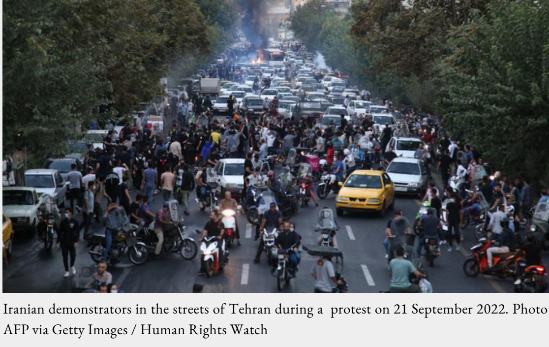
Iranian demonstrators in the streets of Tehran during a protest on 21 September 2022.

Iranian authorities dispersed protests on Tuesday by hovering low over crowds with drones and helicopters, sometimes opening fire on them. The UN Human Rights Council will convene a special session next week to vote on a resolution that will establish a fact-finding mission to investigate Tehran's violations.