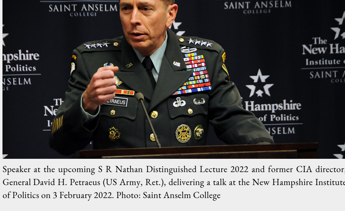
Speaker at the upcoming S R Nathan Distinguished Lecture 2022 and former CIA director, General David H. Petraeus (US Army, Ret.), delivering a talk at the New Hampshire Institute of Politics on 3 February 2022.