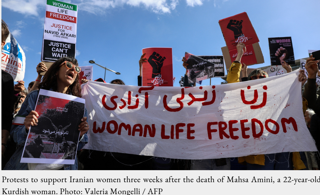
Protests to support Iranian women three weeks after the death of Mahsa Amini, a 22-year-old Kurdish woman.

Following violent crackdowns on protests, President Joe Biden has announced that the US will inflict "further costs" on Tehran. The president has said that the US "will continue holding Iranian officials accountable and supporting the rights of Iranians to protest freely". Iran's Supreme Leader Ayatollah Ali Khamenei has criticised this, accusing Mr. Biden of "hypocrisy" and blaming the US for fomenting the protests.