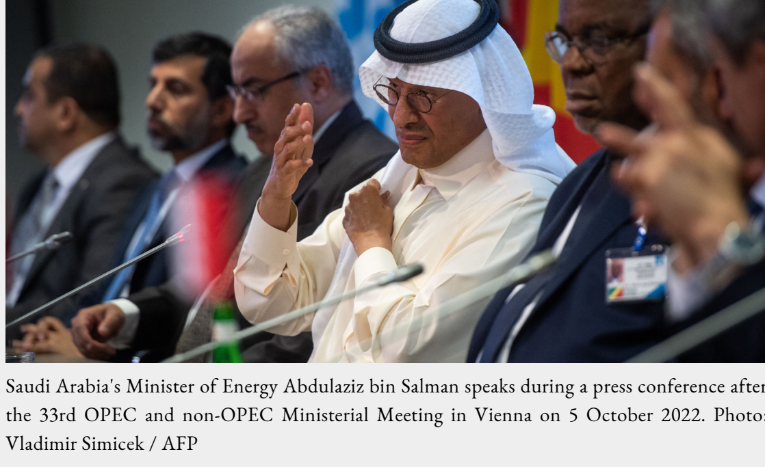
Saudi Arabia's Minister of Energy Abdulaziz bin Salman speaks during a press conference after the 33rd OPEC and non-OPEC Ministerial Meeting in Vienna on 5 October 2022.