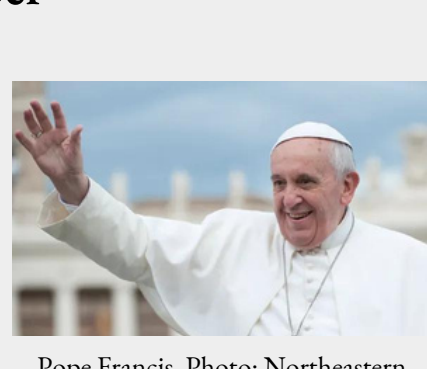
Pope Francis.

Pope Francis will travel to Bahrain from 3-6 November, making him the first supreme pontiff to visit the archipelago nation in the Persian Gulf. The focus of the visit will be the "Bahrain Forum for Dialogue: East and West for Human Coexistence", an international conference.