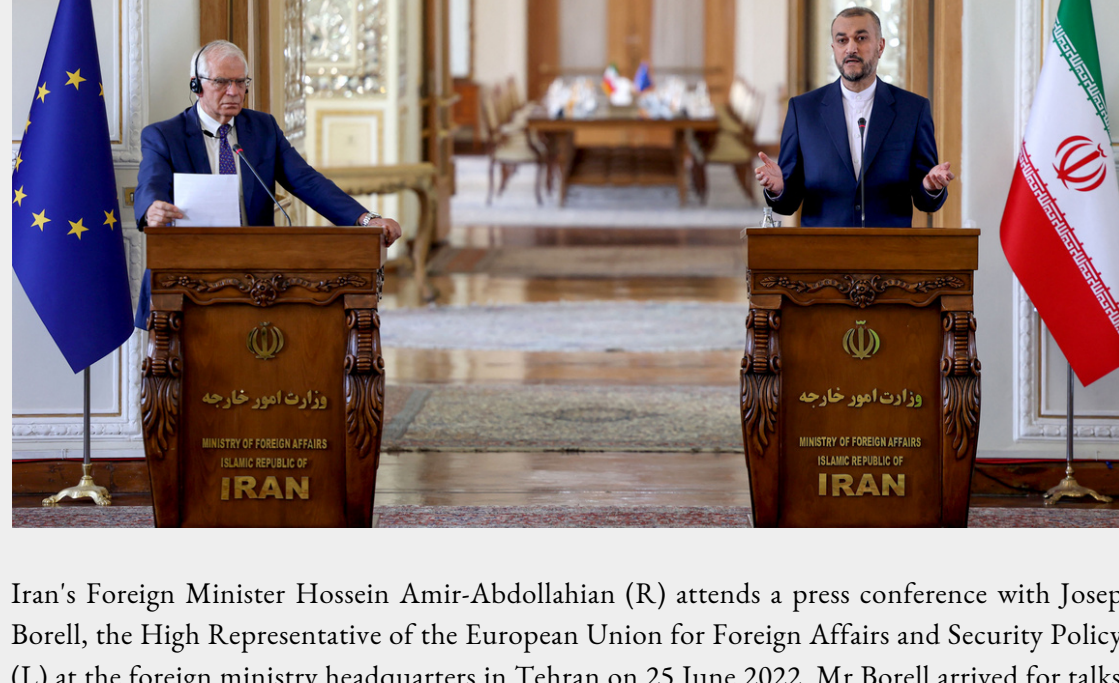
Iran's Foreign Minister Hossein Amir-Abdollahian (R) attends a press conference with Josep Borell, the High Representative of the European Union for Foreign Affairs and Security Policy (L) at the foreign ministry headquarters in Tehran on 25 June 2022. Mr Borell arrived for talks on efforts to revive the 2015 Iran nuclear deal but the negotiations remain stalled.