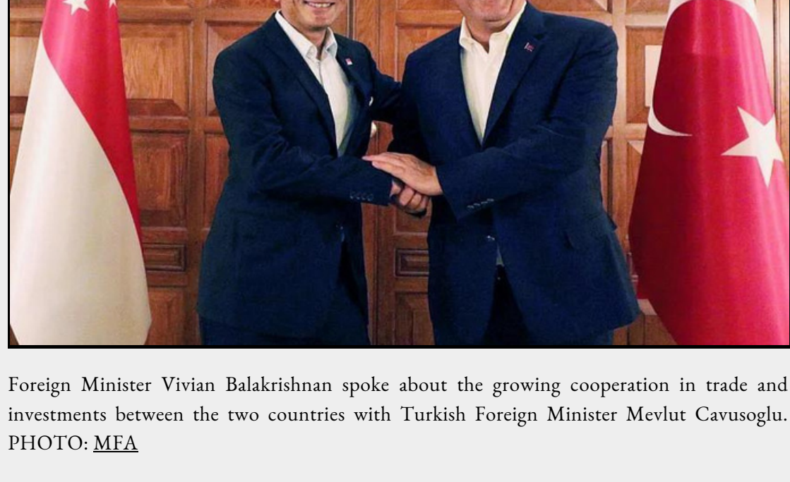
Foreign Minister Vivian Balakrishnan spoke about the growing cooperation in trade and investments between the two countries with Turkish Foreign Minister Mevlut Cavusoglu.

On Saturday, Singapore's Foreign Minister Vivian Balakrishnan met with Turkish Foreign Minister Mevlut Cavusoglu in Ankara to discuss expanding agricultural and food product imports from Turkey. The countries have been strong trade partners, with bilateral trade in goods up 50 per cent last year, reaching a historic high despite the pandemic.