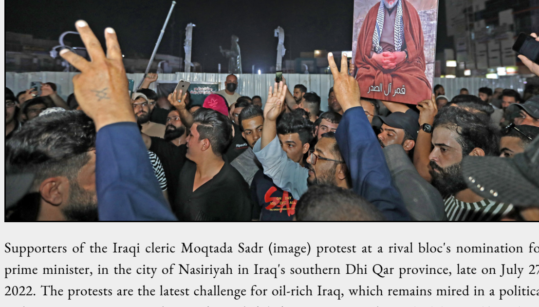
Supporters of the Iraqi cleric Moqtada Sadr (image) protest at a rival bloc's nomination for prime minister, in the city of Nasiriyah in Iraq's southern Dhi Qar province, late on July 27, 2022. The protests are the latest challenge for oil-rich Iraq, which remains mired in a political and a socioeconomic crisis despite elevated global energy prices.