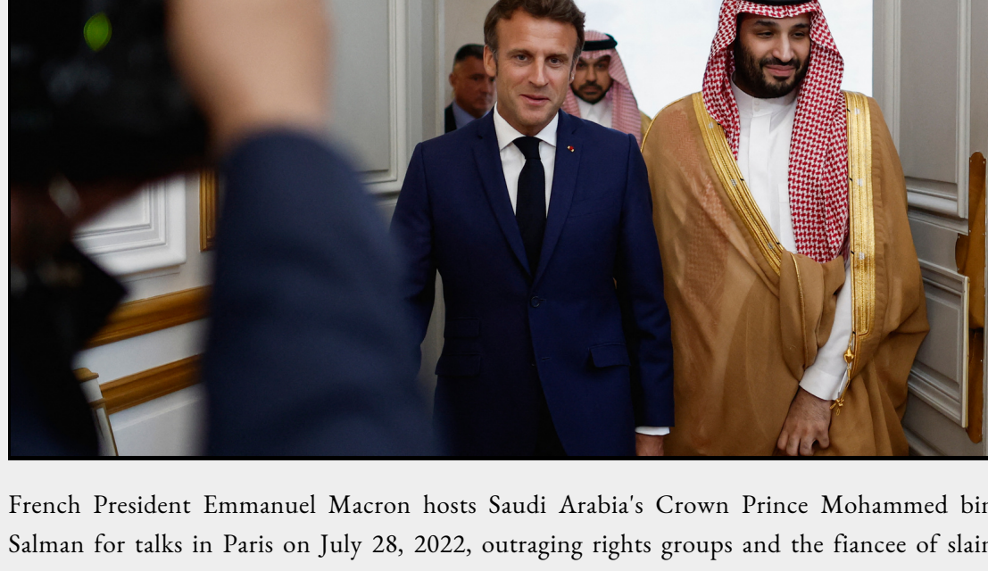
French President Emmanuel Macron hosts Saudi Arabia's Crown Prince Mohammed bin Salman for talks in Paris on July 28, 2022, outraging rights groups and the fiancée of slain Saudi journalist Jamal Khashoggi.

In his first visit to Europe since the 2018 killing of journalist Jamal Khashoggi, Saudi Crown Prince Mohammed bin Salman visited French President Emmanuel Macron to discuss the rattled oil markets following Russia's invasion of Ukraine. A presidential aide said the Iran nuclear deal and human rights in Saudi Arabia were also on the agenda. The leader also visited Greek Prime Minister Kyriakos Mitsotakis in Athens, and stated that their two countries would sign a deal on renewable energy as well as discuss other investments and security.