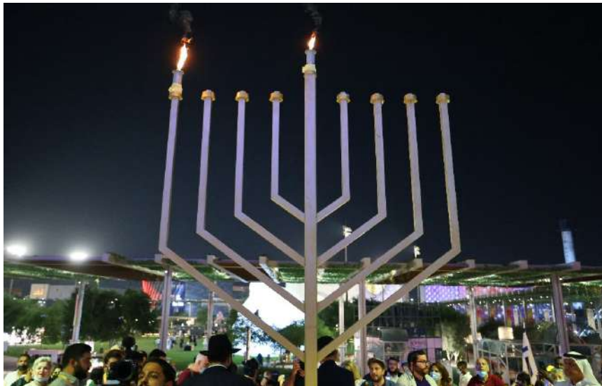
A large menorah is seen lit at the Israeli Pavilion of Expo 2020 in the Gulf emirate of Dubai on 28 November 2021, marking the Jewish festival of Hanukkah. The increasing openness of Jewish life in the Persian Gulf emirate of Dubai is another sign of an emerging new reality in the Middle East, where Israel's isolation by the Arab world is ebbing.