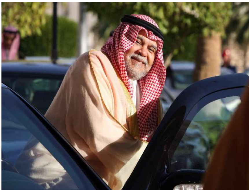
Prince Bandar bin Sultan bin Abdul Aziz al-Saud, Saudi Arabia national security council secretary general and the kingdom's former ambassador to the United States, who allegedly sold a $155 million country estate in England in 2021.

Crown Prince Mohammed bin Salman has curtailed the al Sauds' lavish spending, demonstrating his intent to reshape the kingdom in the long term. Members of the ultra-wealthy ruling family are known for their extravagance and accumulating wealth through illicit means. Now, they are being forced to liquidate assets in order to deflect the attention of the crown prince, who is determined to put the family onto a disciplined, defined regimen and limit the power of potential rivals.