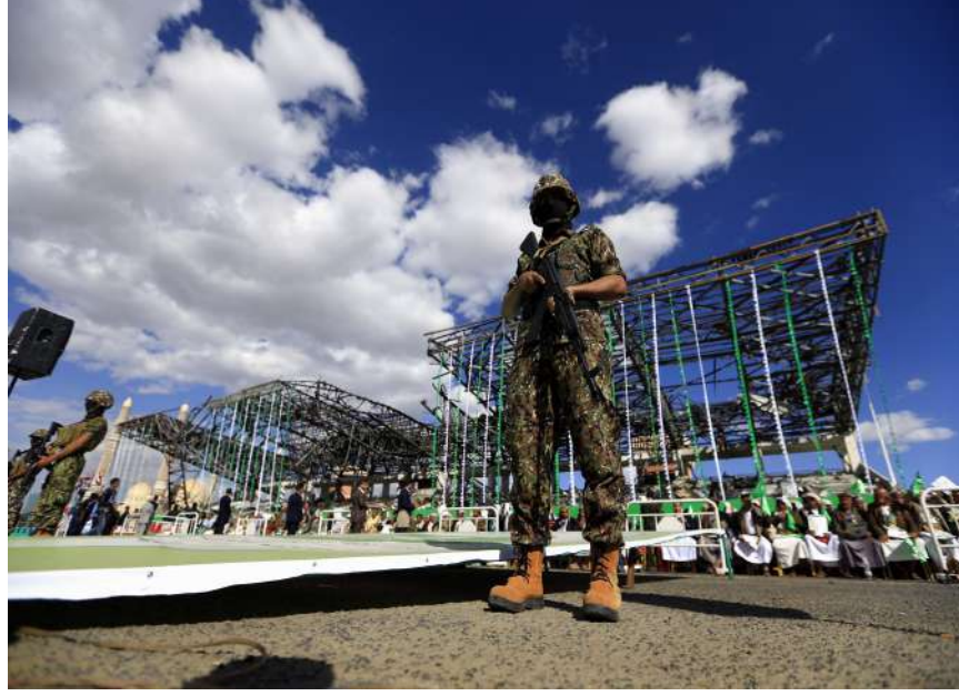
A picture showing Yemeni fighters, loyal to the Shi'i Houthi movement, secure a rally marking the birth anniversary of Islam's Prophet Mohammad in the capital Sanaa, on 20 November 2018.

Previously they were dismissed as unsophisticated rebel fighters, but now the Houthis movement is armed with a vast arsenal of ballistic missiles, kamikaze boats and long-range drones. Thanks to Iran's backing they have extended their reach far beyond Yemen's borders and become part of the Iranian proxy network. The self-proclaimed Axis of Resistance also includes the Syrian government of President Bashar al-Assad; its purpose is to fight Israeli and American influence in the region. This has left Arab countries scrambling to counter Iran and the Houthis, with Saudi Arabia and the UAE looking to Israel as a possible defence partner.