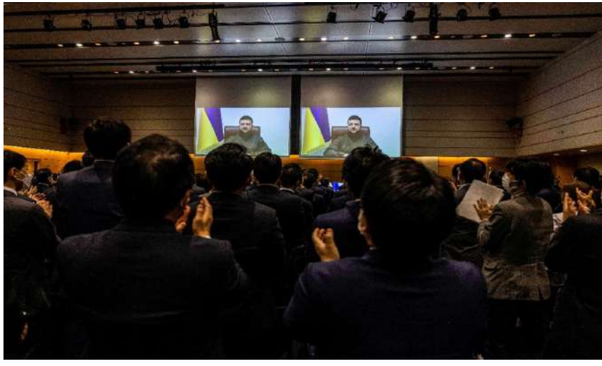
Members of Japan's lower house of parliament applaud at the end of a speech by Ukrainian President Volodymyr Zelensky via a video link at the House of Representatives office building in Tokyo on Wednesday, 23 March 2022. Last Sunday, during a similar speech to the Israeli Knesset, President Zelensky had criticised the Israeli government for not providing his country with the Iron Dome anti-missile system and other defensive weapons for the war against Russia.

The Israeli government rejected requests from Ukraine and Estonia in recent years to purchase and use Pegasus – the powerful spyware tool – to hack Russian mobile phone numbers, according to people with knowledge of the discussions. Israel feared that selling the cyberweapon to adversaries of Russia would damage Israel's relationship with the Kremlin, they said. Both Ukraine and Estonia had hoped to buy Pegasus to gain access to Russian phones, presumably as part of intelligence operations targeting their increasingly menacing neighbour in the years before the current crisis but Israel's Ministry of Defence refused to grant licenses to NSO Group, the company that makes Pegasus, to sell to Estonia and Ukraine.