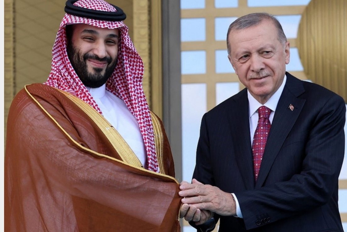
Turkey's President Recep Tayyip Erdogan (R) shakes hands with Crown Prince of Saudi Arabia Mohammed bin Salman (L) during an official ceremony at the Presidential Complex in Ankara, on June 22, 2022.

Saudi Arabia's Crown Prince Mohammed bin Salman's visit to President Erdogan in Turkey this week marks a turning point in the relations between the two countries following years of bitter tensions after the killing of journalist Jamal Khashoggi in 2018. The countries signed a joint memorandum stating that they are determined to start a "new period of cooperation". Relations improved after President Erdogan endorsed Khashoggi's murder trial being moved to Saudi Arabia, and he has an economic imperative to strengthen relations with the Gulf country as Turkey sources much of its natural gas from Russia and its economy has been battered by inflation.