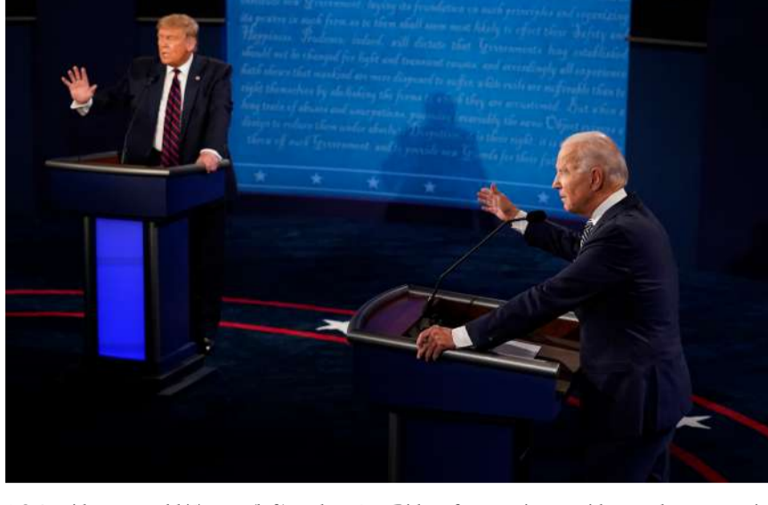
US President Donald Trump (left) and Mr Joe Biden, former vice-president and Democratic presidential nominee, speaking during the first presidential debate at Case Western Reserve University in Cleveland, Ohio, on 29 September. Recent evidence uncovered suggest Russia and Iran are attempting to influence the presidential election as it enters its final two weeks.