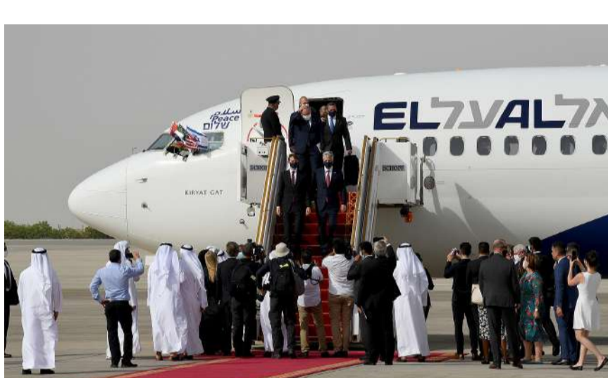
The first direct El-Al flight to the United Arab Emirates arriving at the international airport of Abu Dhabi on 31 August 31, carrying US National Security Agent (NSA) Robert O'Brien, Senior Advisor Jared Kushner and a delegation of Israeli officials headed by Israeli NSA Meir Ben-Shabbat. Recently, Israel and the UAE signed an agreement for reciprocal visa-free travel for their citizens.

Israel and the United Arab Emirates (UAE) have agreed to allow their citizens reciprocal visa-free travel as direct flights begin, the first such arrangement between Israel and an Arab state aimed at bolstering business and tourism ties. This is a significant move for the UAE, considering that Abu Dhabi does not accord many of its own close allies, such as Egypt and Jordan, the same privilege. Besides the visa waiver, the two countries signed various other agreements that included aviation, science and technology, and investment protection. Along with the US, they also launched a fund that aims to raise US$3 billion in private investment for development and other projects in the Middle East.