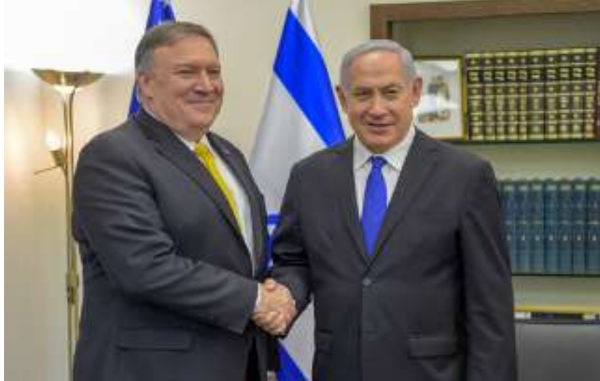
US Secretary of State Mike Pompeo (left) meeting Israeli Prime Minister Benjamin Netanyahu in Tel Aviv on 29 April 2018.