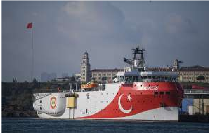
Turkey's Oruc Reis , a seismic research vessel which searches for energy reserves, docking at Haydarpasa port on 23 August amid tensions with Greece and the rest of the EU.

The UAE sent four F-16 fighter jets to Crete for joint training with the Greek military amid mounting maritime dispute over Turkish gas and oil exploration in the eastern Mediterranean. The deployment took place after the UAE announced its normalisation of ties with Israel on 13 August, a deal that angered Ankara. Israel maintains broad cooperation with Greece and has participated in numerous military exercises, following the worsening of Jerusalem's relations with Turkey. Abu Dhabi's move marked the latest sign of renewed regional opposition to Turkish ambitions in the Mediterranean.