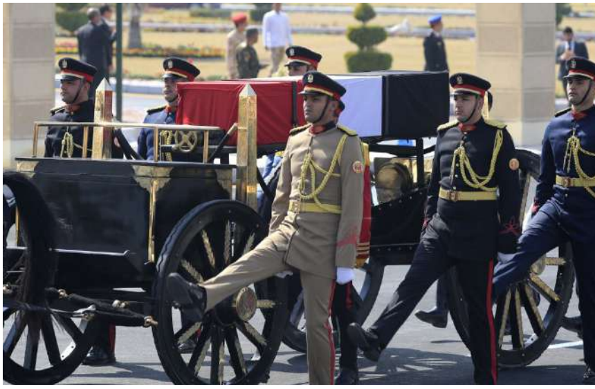
Egyptian honour guards escort the coffin of former president Hosni Mubarak during the funeral ceremony, which was held at the Mosheer Tantawy Mosque in Cairo, Egypt on Wednesday (26 February).

Iran has grown to be one of the largest focal points for the spread of the coronavirus (Covid-19), second only to China, reported The New York Times on Monday (24 February). Factors such as its status as a hub for religious and commercial travel, an ill-equipped healthcare system in the aftermath of US economic sanctions and the Iranian regime's lack of transparency has led to a massive outbreak of at least hundreds of cases, with an unusually high mortality rate of 14 per cent. Experts warn that the virus is spreading to other countries in the region. Iranian authorities are scrambling to curb a growing pandemic, as even the country's own deputy health minister, Mr Iraj Harirchi, has contracted the virus.